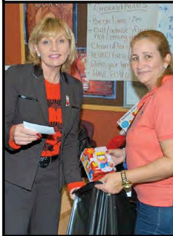
Lt. Governor Guadagno helps PRAHD staff with gifts