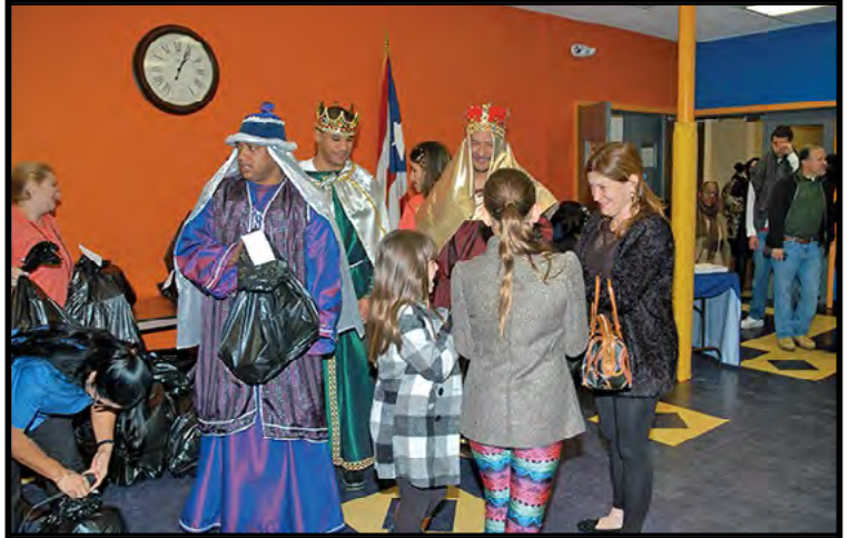
The Three Kings hand out Gifts to Children