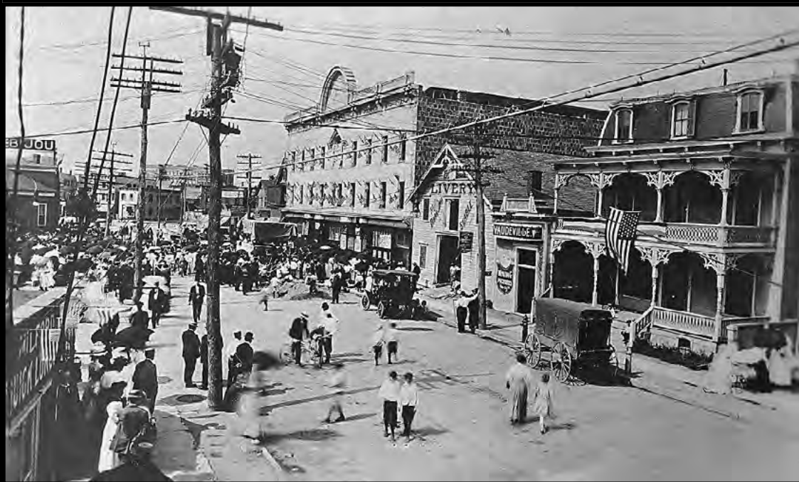
PERTH AMBOY - Opening Day, Jefferson Market circa 1909, Jefferson Street. *Photo Courtesy of Anton Massopust This Photo was restored under a grant for the Kearny Cottage Archiving project by the Middlesex Cultural and Heritage Commission