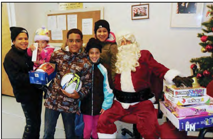
PERTH AMBOY - There were 314 happy children come on 1/4/15 to the Perth Amboy St. Vincent dePaul Food Pantry for presents to celebrate their annual Christmas (Three Kings Day) Toy Distribution.