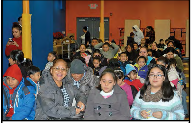
A Crowded Room