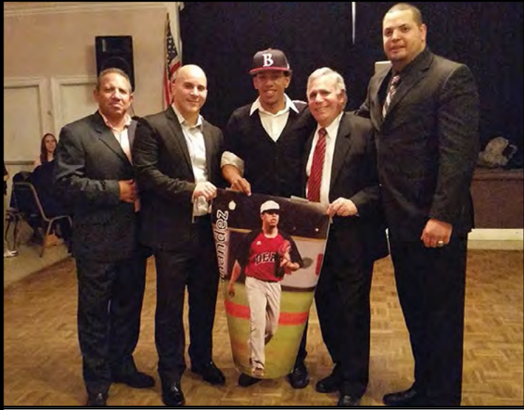
PERTH AMBOY - 1st annual Perth Amboy Baseball Alumni Dinner held 12/28/14 at the Portuguese Club Honoring the Jose Hernandez Scholarship Fund.