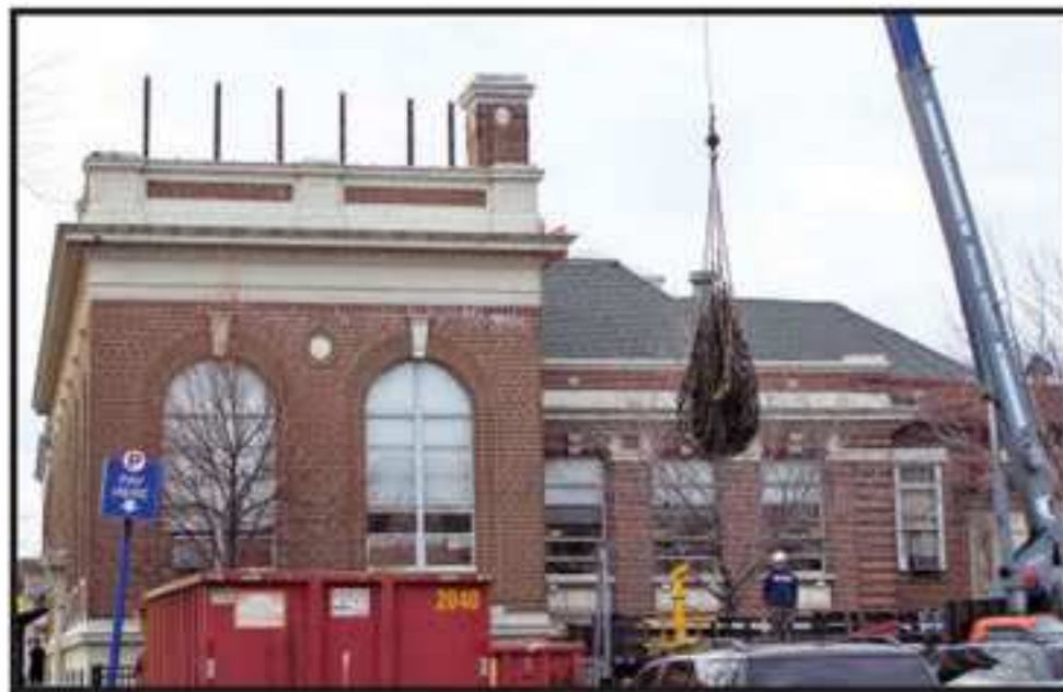
PERTH AMBOY - The Perth Amboy Free Public Library finally gets a roof replacement after long years of leaks causing damage to the interior.

METUCHEN - The Borough of Metuchen Invites you to a New Year's Eve Fireworks Extravaganza on December 31 at midnight at Downtown Metuchen. Sponsored by the Metuchen Savings Bank. Make your dinner reservations early! Contact your favorite dining establishment to inquire about their special plans for New Year's Eve.