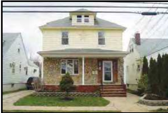
SAYREVILLE - Great "move-in" condition many upgrades, 2 bedrms, attic for storage only. On street parking. $1,200/mo rent