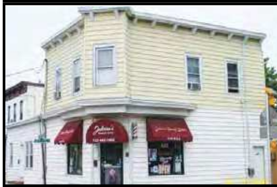
PERTH AMBOY - This is a good investment. Building fully rented. Brand new gas furnace. Just present an offer. Seller very motivated. Month to month rental. Don't miss this one. Show after 5 p.m. on weekdays. 11 a.m. to 7 p.m. weekends. Bring offer. Buyer is resp. for all certificates and inspections. $225,000