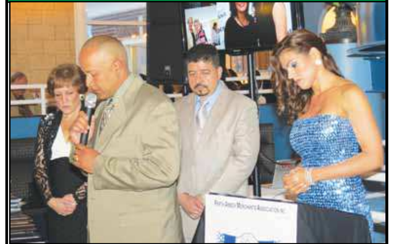
Invocation is given