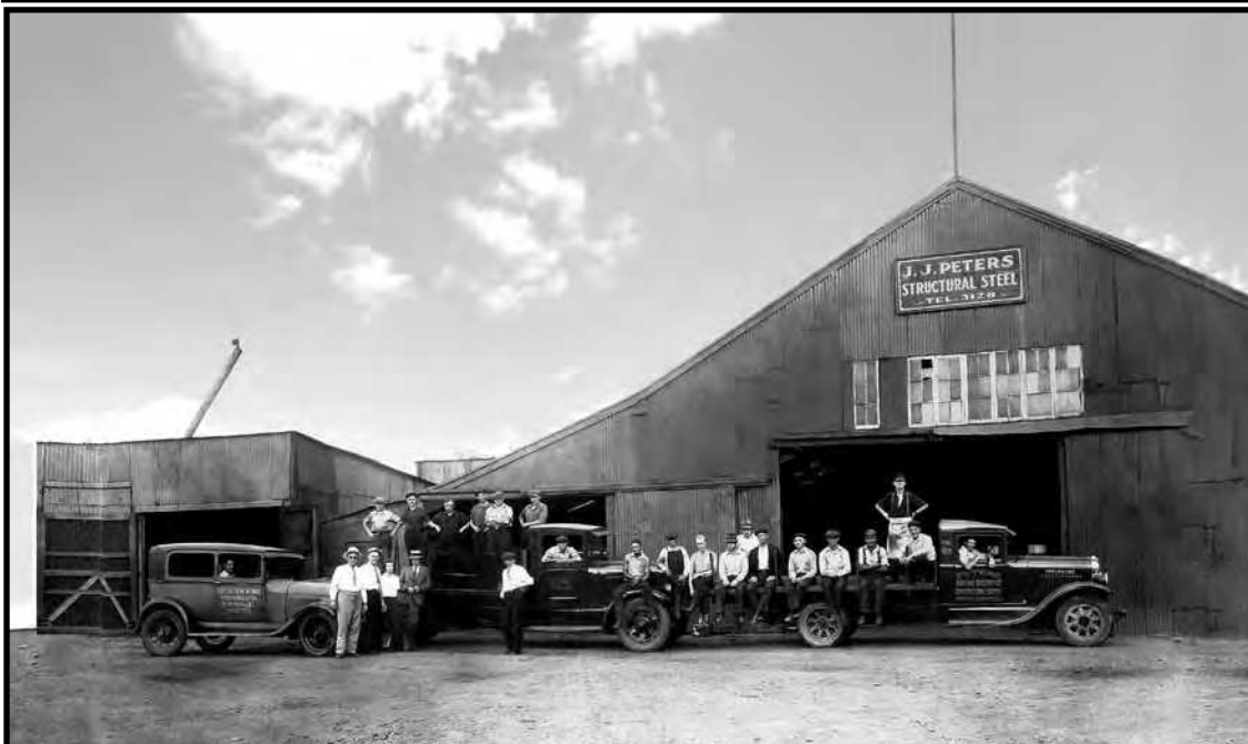
PERTH AMBOY - Circa 1930's - The J.J. Peterson Structural Steel. The factory was located on South Second Street. The building is recently being demolished.