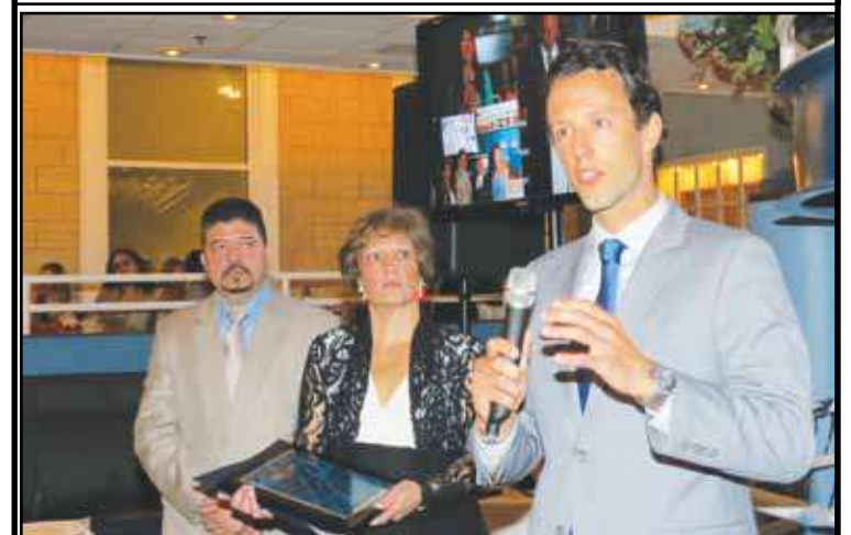
The committee presents an award to Vopak