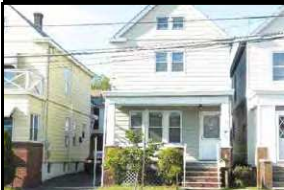
PERTH AMBOY - Great looking Colonial. 3 bedrm, close to hospital, eik and formal dining room, large living room. Ready for a big family. House is being sold in "as is" condition. $169,900