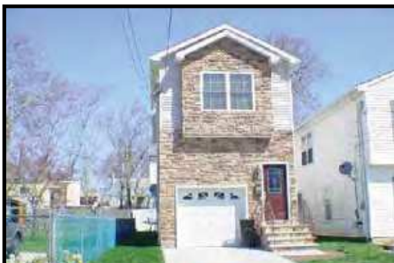
PERTH AMBOY - Check out this great 5 yr old home. Better than new. Nice layout, great neighborhood. Granite, stainless steel appliances. Master bedroom has an En-suite. Looking for a townhome/condo; this is even better . . . No Maintenance Fees!!! A MUST SEE!!! $262,000