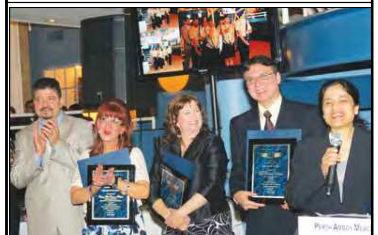
The educators are recognized