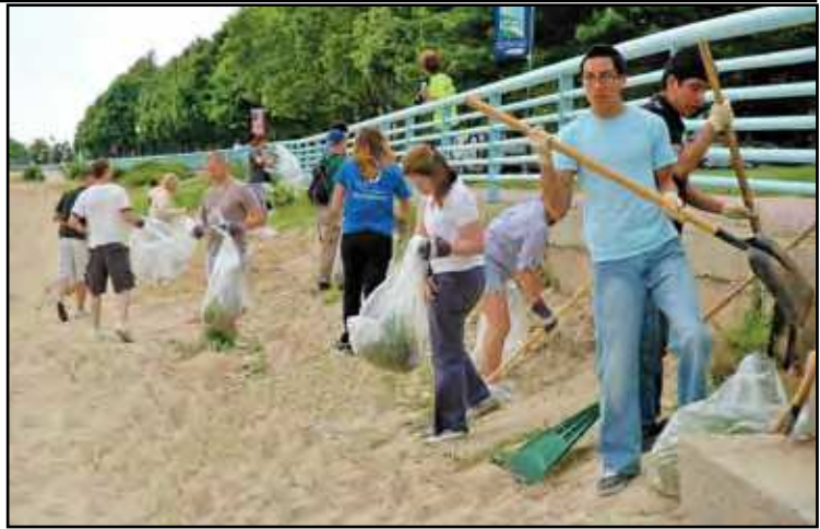
Cleaning up the beach!