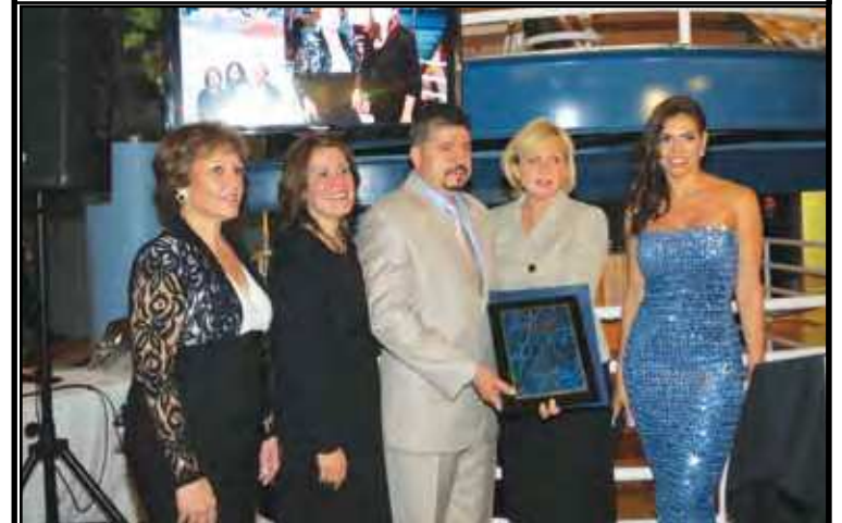
The committee presents an award to Lt. Gov. Kim Guadagno