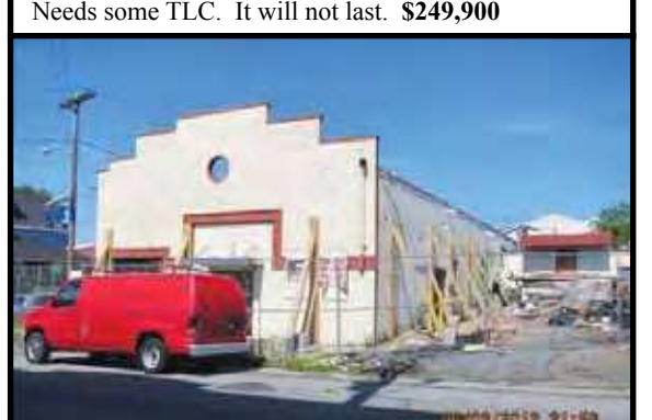
PERTH AMBOY - The value is on the land this was a food processing location which collapsed. Prime corner lot. Buyer is resp. for all clean-up, permits and all due diligences and for uses please contact the Perth Amboy Building or Zoning Dept. $100,000