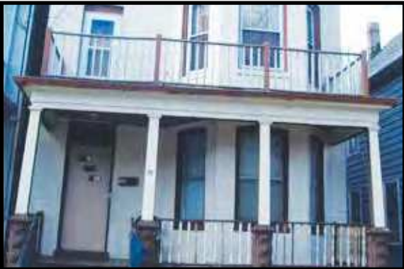
PERTH AMBOY - Great 2 family - 1 detached garage - 3 bdrm in 1st apt - 3 bdrm -in 2nd apt - In good location downtown area. Both have kitchen, living room and bathroom. $300,000