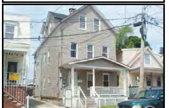
PERTH AMBOY - Great investment, all apartments are in excellent condition. $279,000