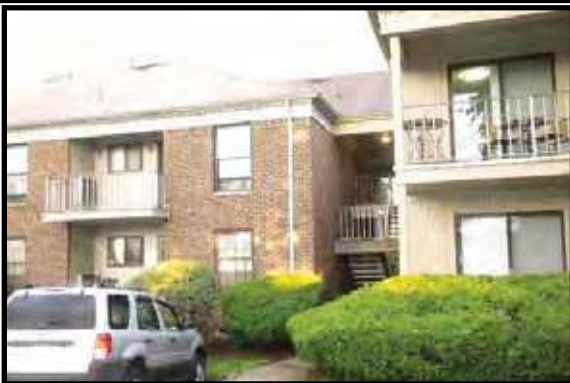
WOODBIDGE PROPER - If commission is reduced will split 50/50. Short Sale. Buyer is resp. for all inspections and repairs. $170,000