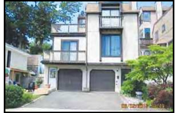
PERTH AMBOY - Water, Water and More Water stunning water view. This townhouse styled features 3 bedrms, 1.5 bath, 2 car garage, beautiful deck overlooking a terrific ocean view. A/C, fireplace. Great potential. Needs some TLC. It will not last. $249,900