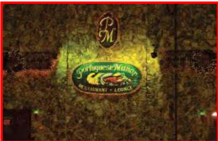
Ring in the New Year at the Portuguese Manor's at the New Years Eve Blast! Great Food! Good Fun & Dancing

WOODBIDGE - The 21st Annual Holiday Train Show Exhibit at the Barron Arts Center, 582 Rahway Ave. will be from December 1 to 28. M-F 11 a.m. to 4 p.m. and Sat & Sun 2 p.m. to 4 p.m. (Closed December 25) Opening Reception, November 30 from 5 p.m. to 7 p.m. featuring Santa, Mrs. Claus and many other surprises. For more info call 732-634-0413. Sponsored by The Club at Woodbridge.