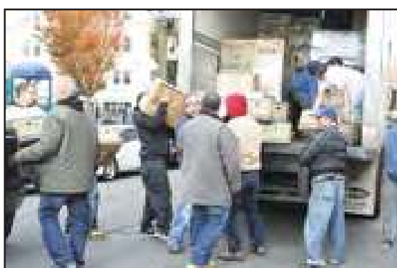
Supremo Foodmarket loads a truck of supplies to be donated to Sandy victims in Staten Island