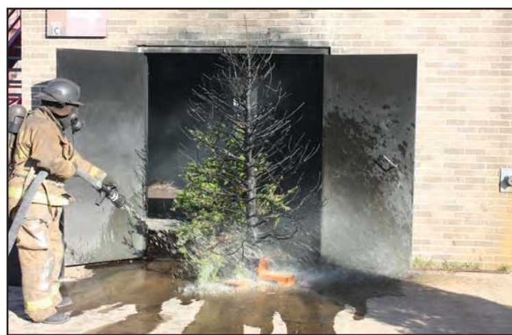
Live Burn Demonstration of a Christmas Tree

and properly. Do not leave it in a garage, on a porch or at the side of a house. A dried out tree is highly flammable and can still cause major damage from these locations. Check with your local community for a recycling program or other disposal options. In addition to the Christmas tree, holiday lighting represents another major fire hazard but, again, simple steps can greatly reduce the risk. • Always make sure your lights have the label of an independent testing laboratory such as Underwriters Laboratories (UL). Such organizations carefully test products to ensure safety and reliability. • Replace any lights with worn or broken cords or loose bulb connections. These are hazards that can ignite a fire. • Avoid stringing together too many strands of lights. In general, that means no more than 3 strands of mini lights or 50 screw-in bulbs but remember that LED lighting can burn hotter and may have greater restrictions. Check the manu-