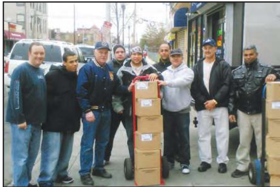
St. Vincent DePaul, Perth Amboy