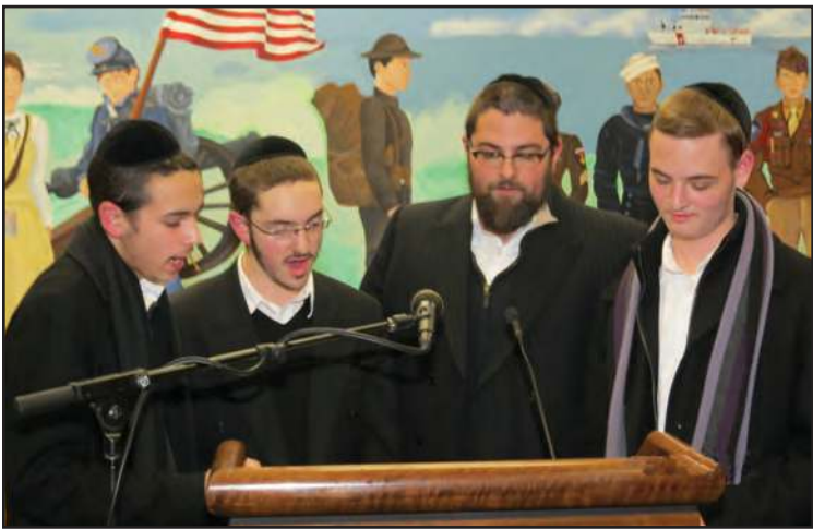
Mekimi Cheer-up Squad perform Chanukah songs