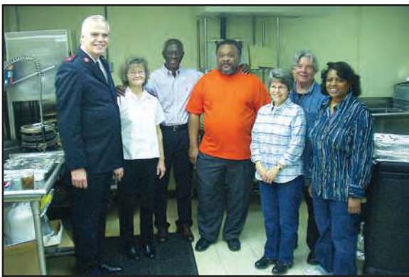
Faith Fellowship, Sayreville at the Salvation Army, Perth Amboy