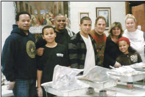
Renovation House, Perth Amboy