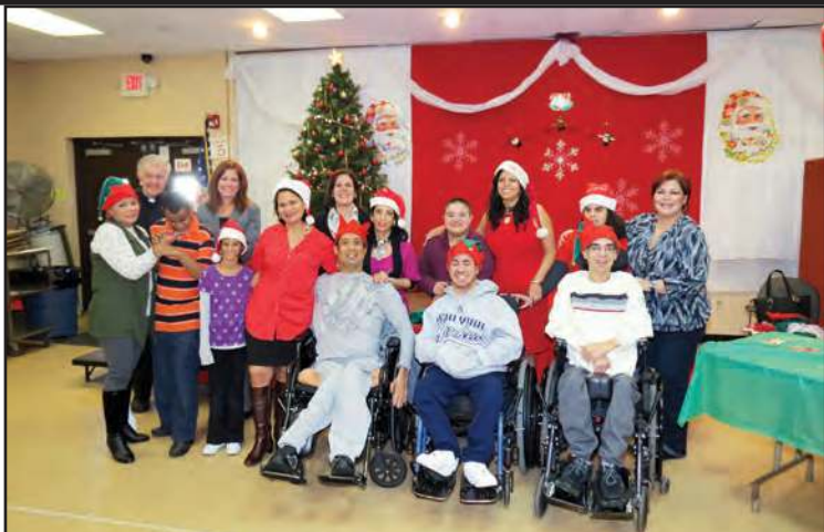
PRAHD Staff pose with guests