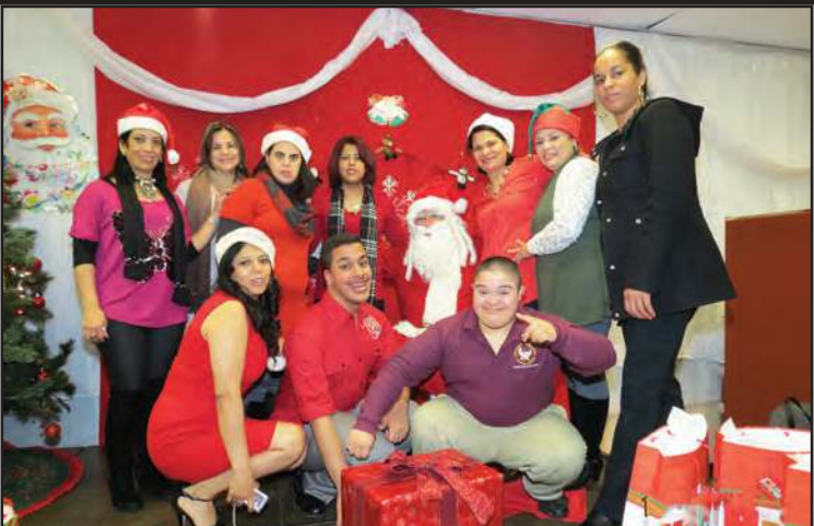
Santa has plenty of gifts for all