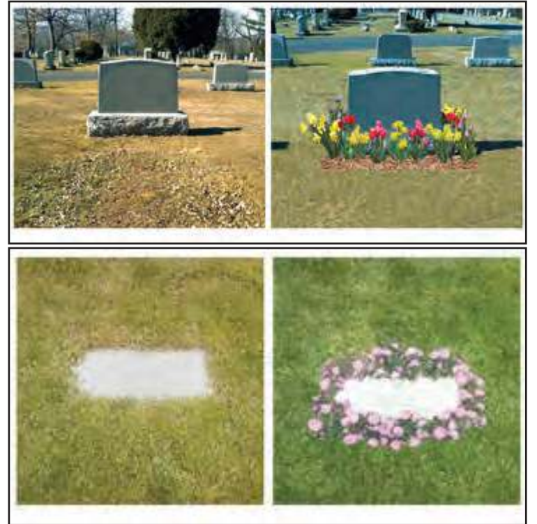
Upright and Flatstone Care before and after