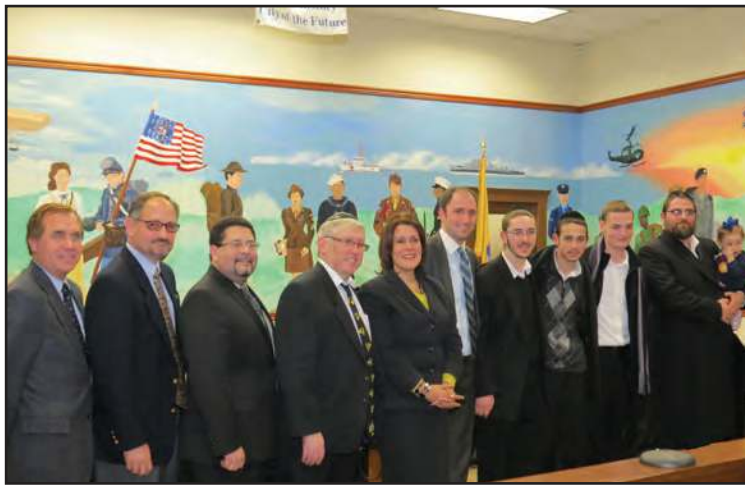
Group photo of all those who participated