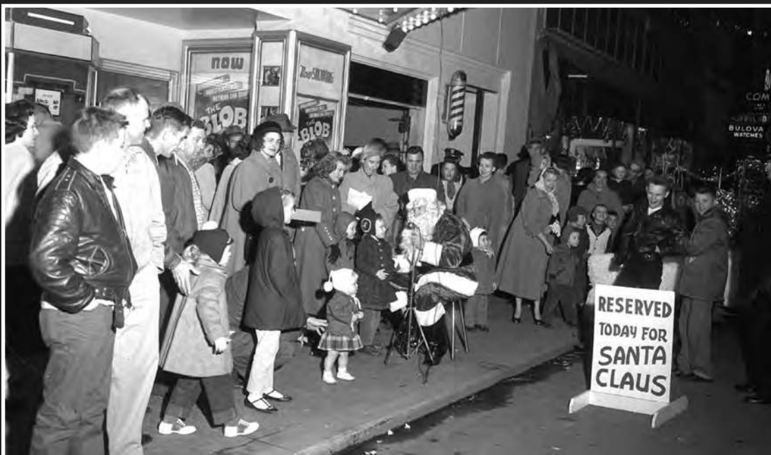
PERTH AMBOY - Santa arrives at the Royal Theater, Smith Street circa 1950's.