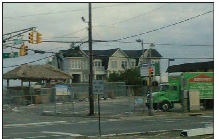
Seabright, NJ had 100% damages to businesses and homes