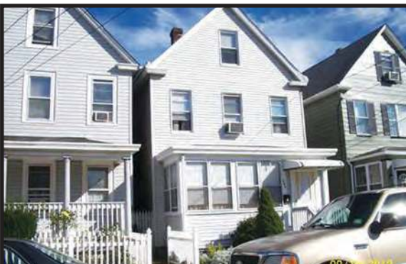
PERTH AMBOY - Well kept property by family for generations. Come and see this nice house where only one family proudly occupied. This is an estate sale. Sold "as is" No questions asked. Buyer resp. for any repairs, C/O and smoke cert. Show and bring offers. Seller willing to negotiate. Fully insulated attic. $189,900