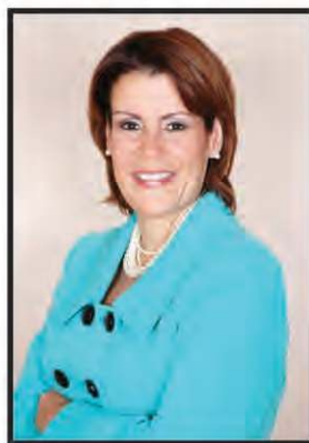
Mayor Wilda Diaz

myrna.febles_unitedforperthamboy@yahoo.com