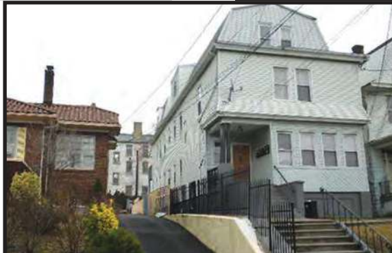
PERTH AMBOY - Great investment property, desirable near waterfront (5) apartments fully rented. 3-3 bedroom apts. & 2-1 bedroom apts. Close to shop-s and public transportation. Seller to obtain C/O. This is not a short sale. $445,000