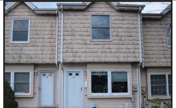
CARTERET - Amazing unit 2 bedrooms, 1.5 bath mint condition a must see. Buyer is resp. for C/O, termite cert and all repairs as well as all due diligence. Note $45 maint. does not include homeowner ins. $164,900