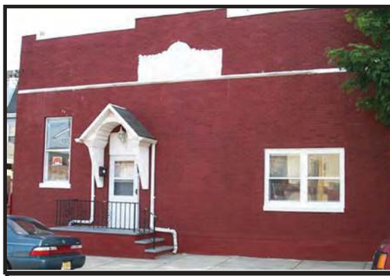
PERTH AMBOY - Very nice property, "move in" condition. Outside freshly painted, brick construction . "Not a short sale." Show it and bring offer. Property features a finished bsmt with full bath. $159,900