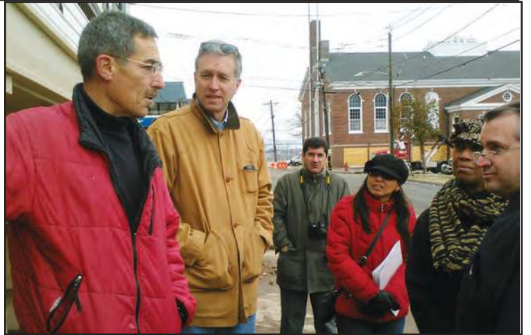
A local Perth Amboy Front Street Resident discusses his damage