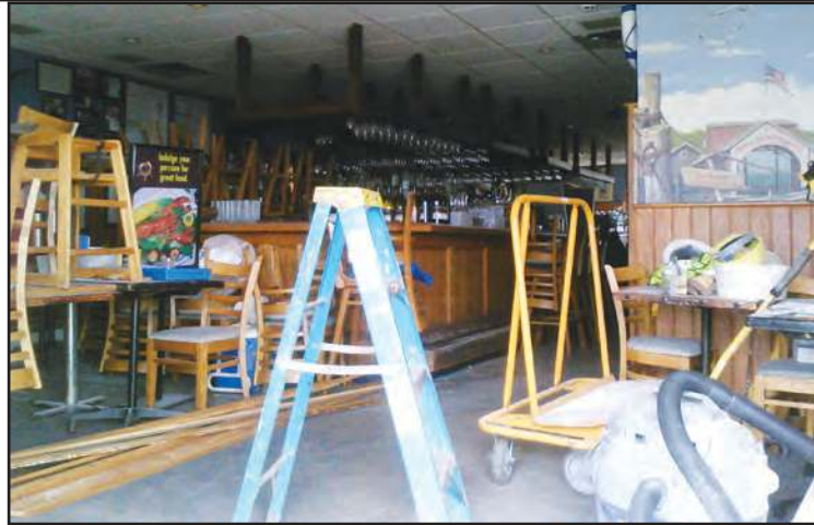
In Perth Amboy, the Barge is making great progress