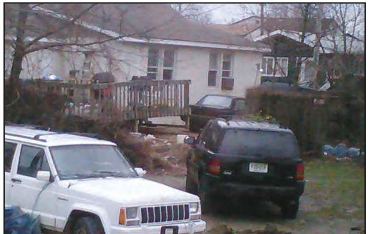
A deck is uprooted in Keansburg