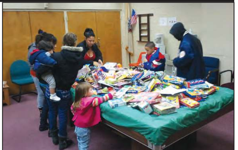
Donations from Renovation House