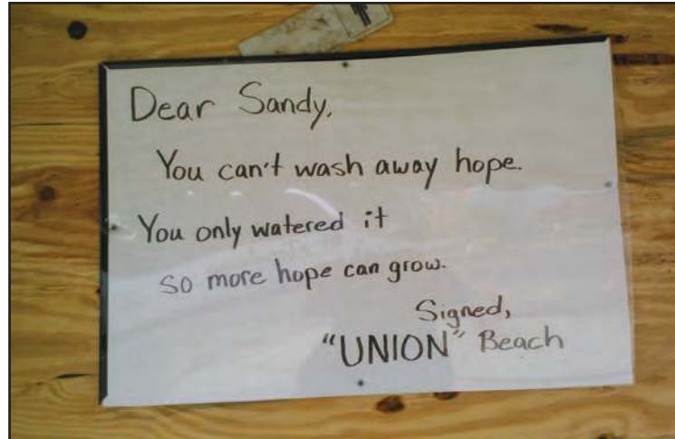
A note to Sandy