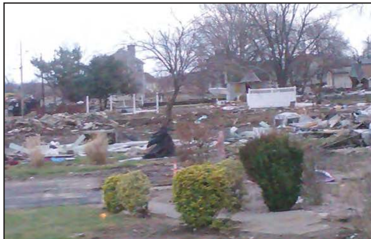
One of the neighborhoods flattened by Sandy's wrath in Keansburg