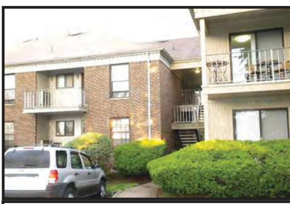
WOODBRIIDGE PROPER - Hardwood flrs move-in condition. Close to Metro Park all major highways and shopping center. If commission is reduced will split 50/50. $109,000