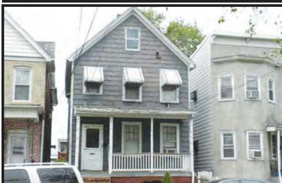
PERTH AMBOY - Nice multifamily with many upgrades. Close to public transportation, couple of blocks from the train station. $399,900