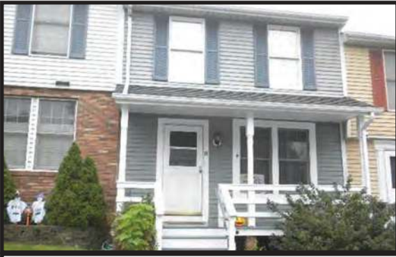
PERTH AMBOY - 2 Story condo with full basement newer deck and front porch, few blocks from Holy Spirit Church convenient to all major highways. $134,900