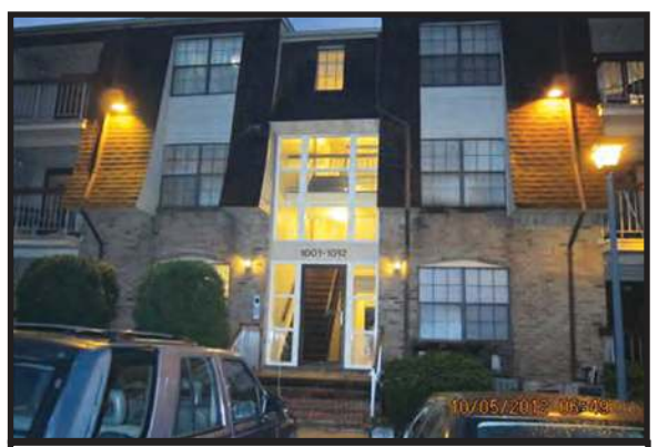
PERTH AMBOY - Priced to sell, a beautiful unit located in the heart of Perth Amboy. Close to everything. Shopping, public transportation, schools, restaurants great potential. $109,000