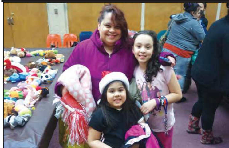
Thanks for the toys!