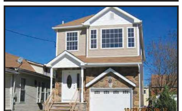
PERTH AMBOY - Brand new 4 hrs. colonial with gleaming hardwood flrs., modern kitchen with granite counter tops, master suite with a huge custom closet, full basement with high ceilings, a "must see." $259,000