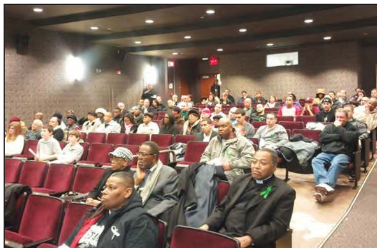
The community turned out for the service