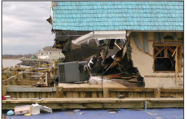
Destruction on Union Beach Waterfront