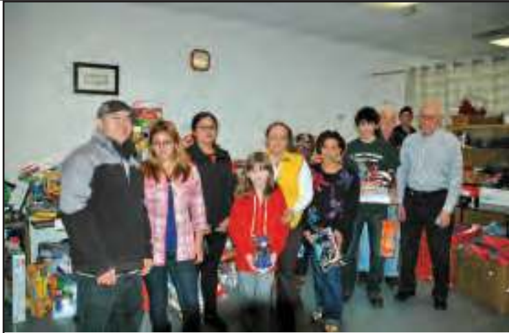
Gifts for all ages