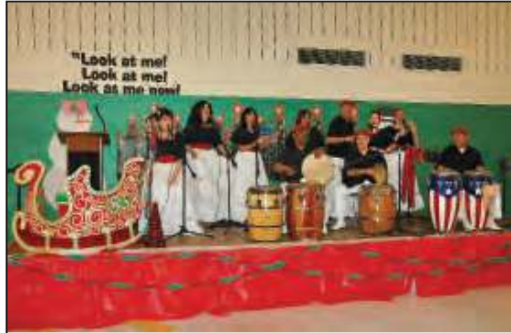
A band entertains