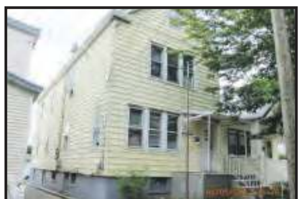
PERTH AMBOY - Great potential. Close to public transportation and all major hwy's. Buyer is resp. for C/O, Termite Cert., and all repairs. This is being sold strictlyl in "as is" condition. Only CASH or FHA 203K. $159,000