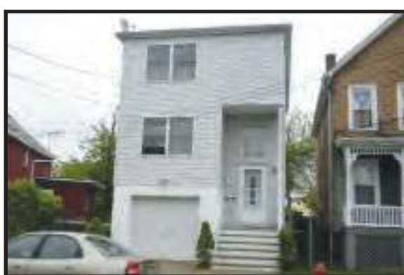
PERTH AMBOY - Short Sale!!! Huge price reduction for 10 year old home. Great value. A "must see." No work needed. $175,000