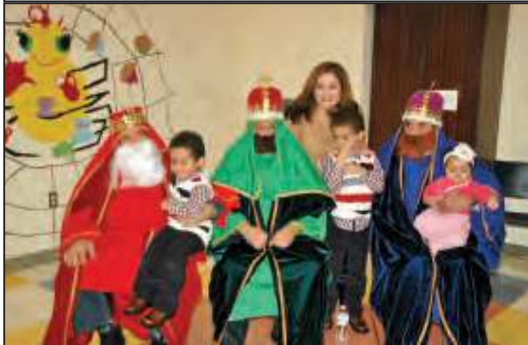
The Three Kings distribute gifts