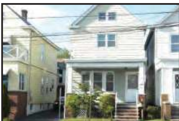
PERTH AMBOY - Great looking colonial, 3 bdrm close to hospital, eik and formal dining room, large living room. Ready for a big family. House is being sold in "as is" condition. $169,900