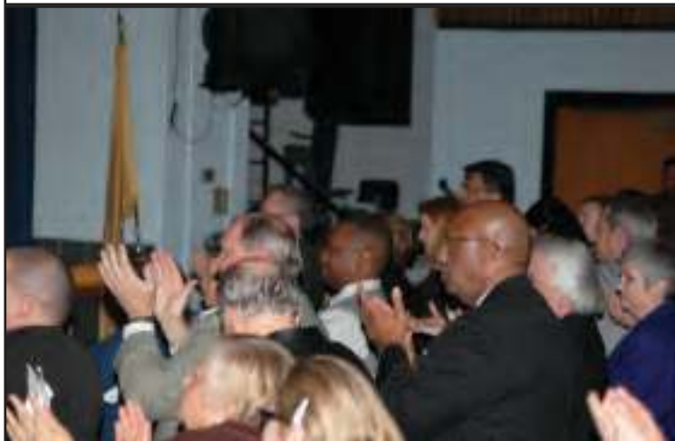
The crowd applauds the newly elected officials