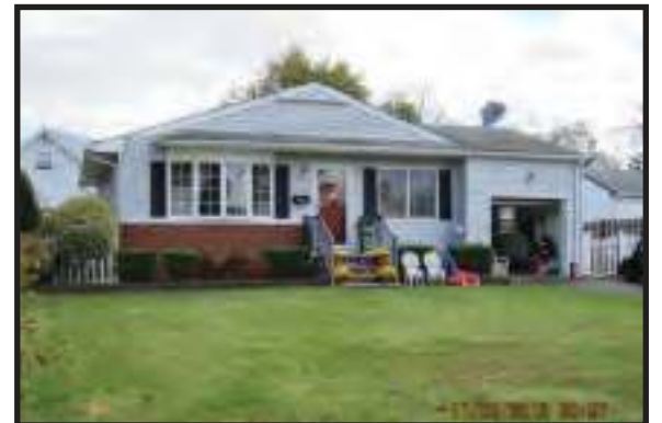
SOUTH PLAINFIELD - This is a family haven. You will adore the dramatic beautiful ranch. 3 bedroom, 2 bath, hardwood flrs, full finished basement, sun room. "Move-in" conditon and much more - a "must see." $304,900