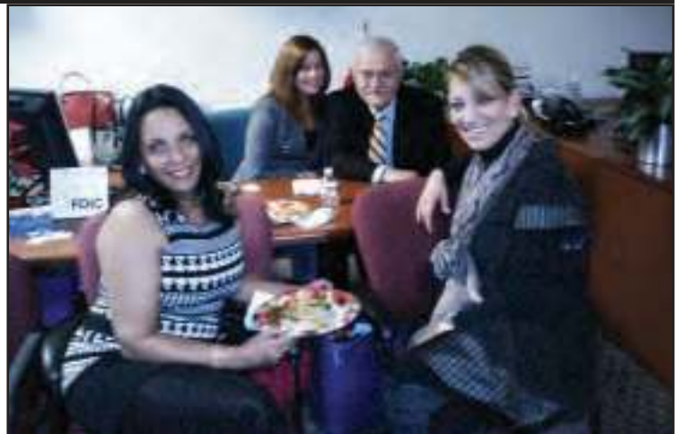
A bite to eat