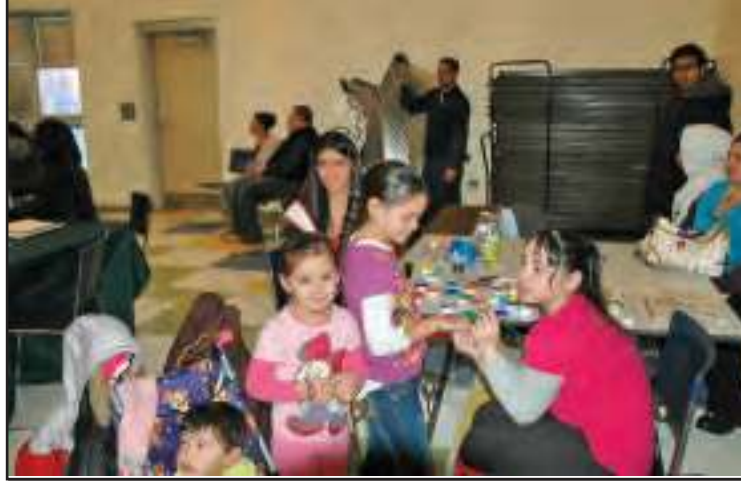
Enjoying the afternoon