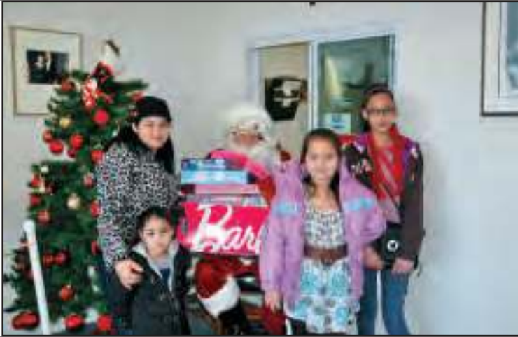
Santa distributes gifts to children