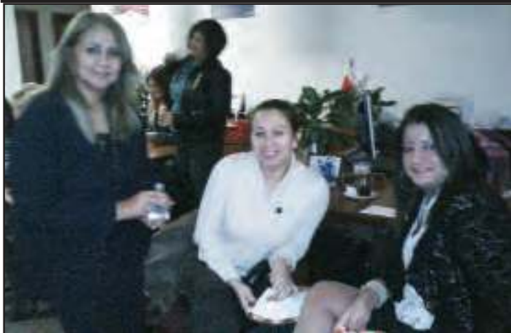
Enjoying the afternoon