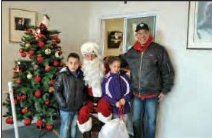
Santa poses for a picture