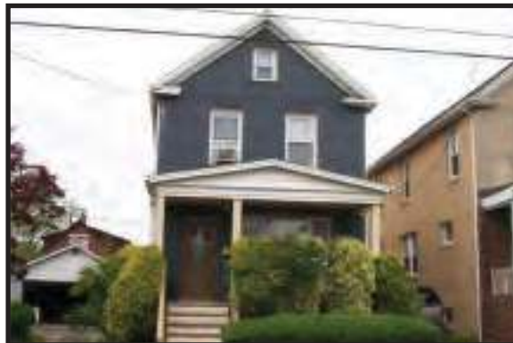
PERTH AMBOY - Move-in Condition house. "Short sale" sold "as is." Buyer resp. for all repairs, inspections and C/O. $114,100