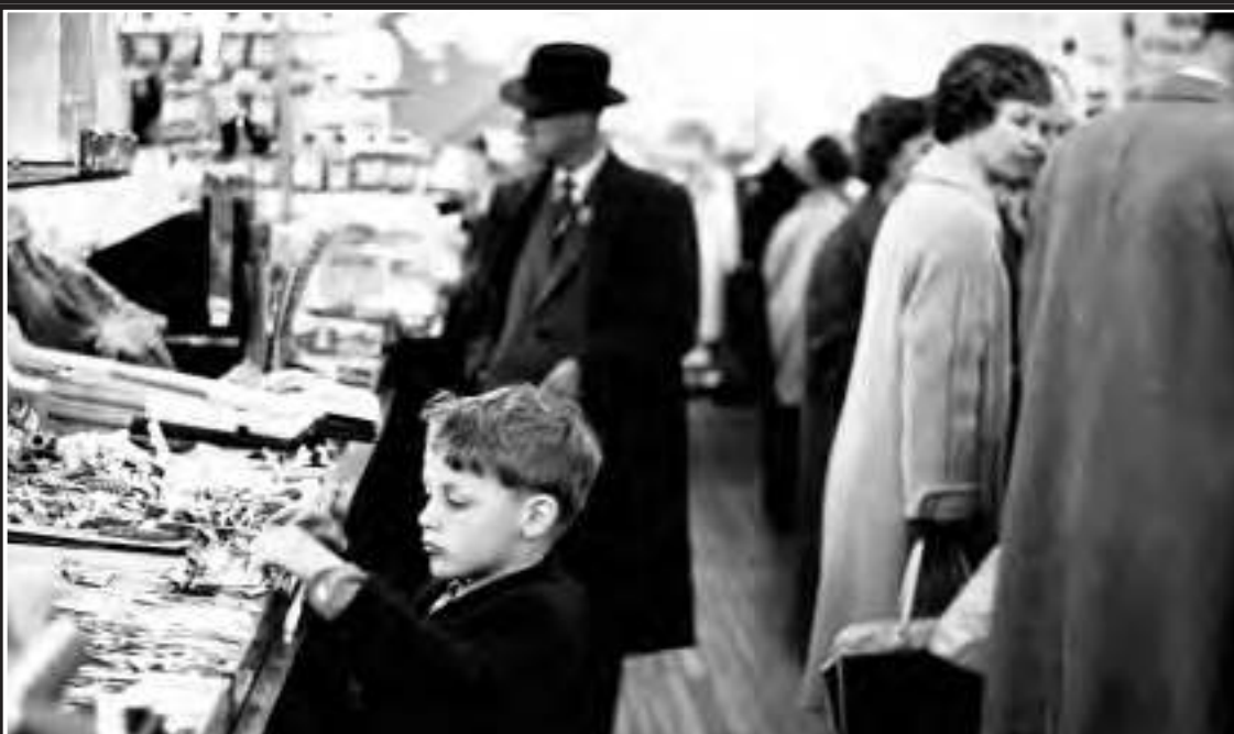
WOODBIDGE - Woolworth's Five & Dime 1950's