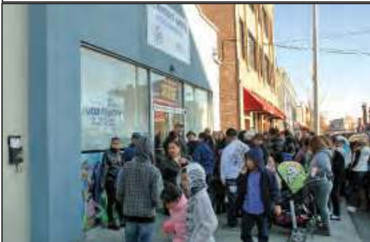
St. Vincent DePaul on Three Kings Day