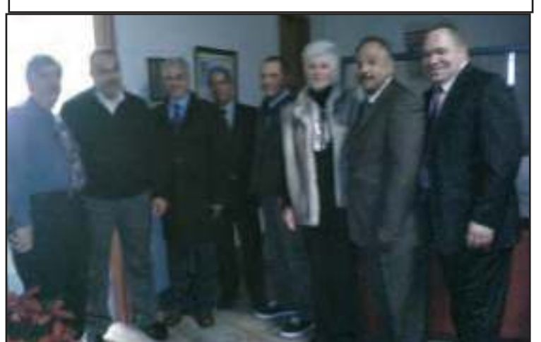
Local businesspeople and local government officials