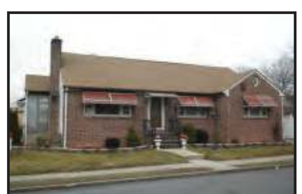
PERTH AMBOY - Beautiful house, hardwood flrs, 3 big bedrms, finished bsmt perfect for your holiday parties. You have 2 new furnaces - 1 in the bsmt and 1 in the attic, wood fireplace - nothing to do just move in. Close to all mayor hwy's, quiet nbhd. There is an oil tank underground, the owner is going to take care of it. $270,000