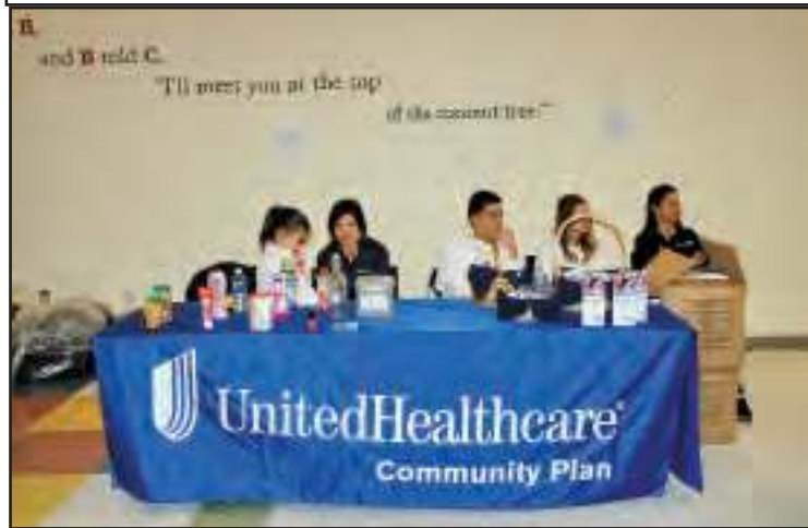
United Healthcare's table