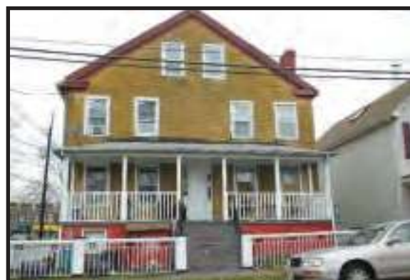
PERTH AMBOY - Investor's dream. All separate utilities. 6 apartments fully rented. 5 - 1 bedrooms & 1 - 2 bedrooms. This is not a short sale. Seller to obtain C/O. $330,000