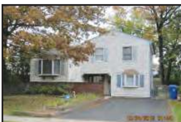
WOODBIDGE PROPER - Well maintained split-level 4brs., 1.5 bath, beautiful kitchen, nice flr plan, close to public transportation. $279,000