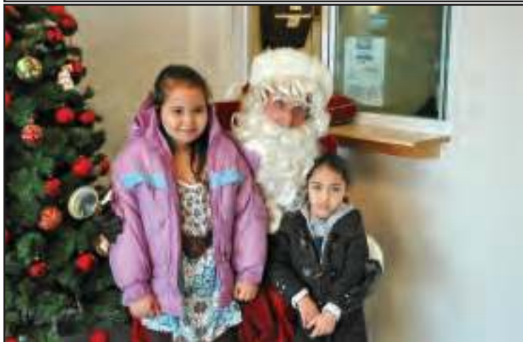
Santa at St. Vincent DePaul