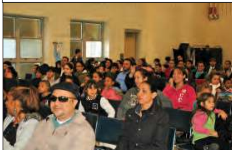
A large crowd turns out for Three Kings Day