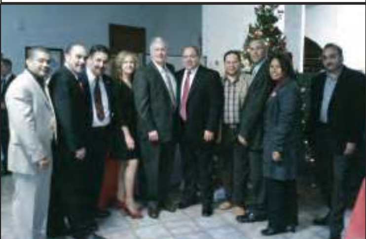
1st Constitution Bank Staff with local businesspeople