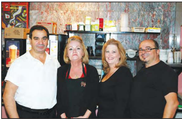
The owners of Superior Diner wish everyone a very happy holiday season!