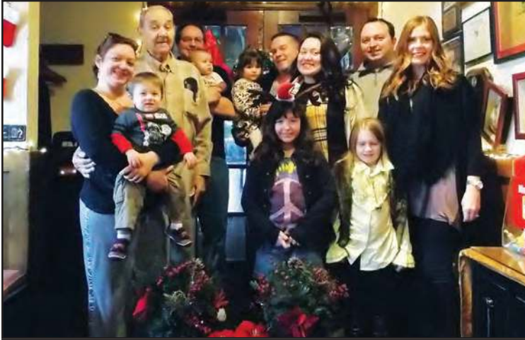
Merry Christmas and Happy New Year from Sciortino's