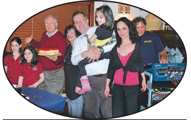
Pantagis Diner wishes everyone a Happy Holiday Season!