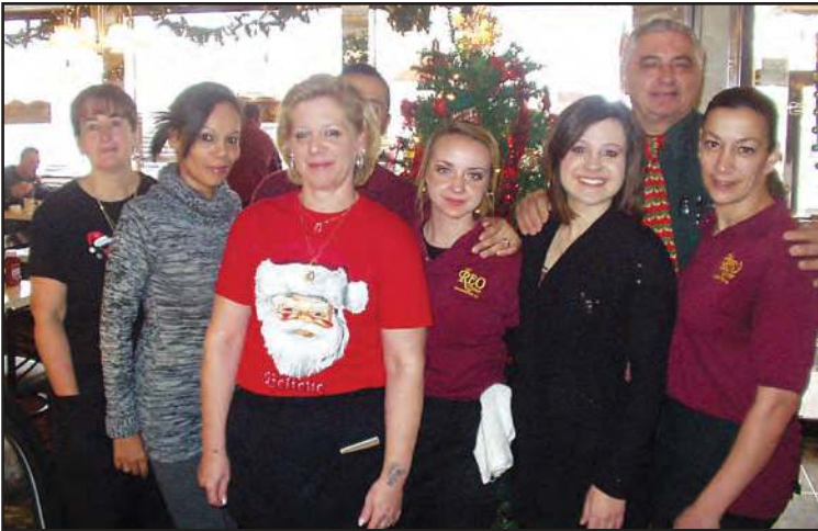
The Reo Diner wishes everyone a Happy Holiday Season!