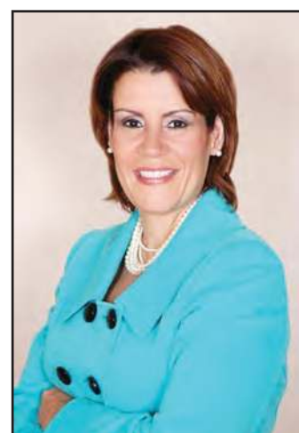
Mayor Wilda Diaz