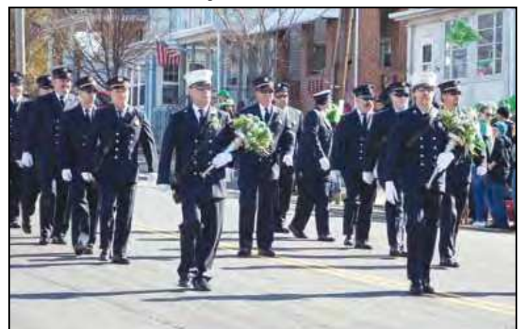
The South Amboy Fire Dept.