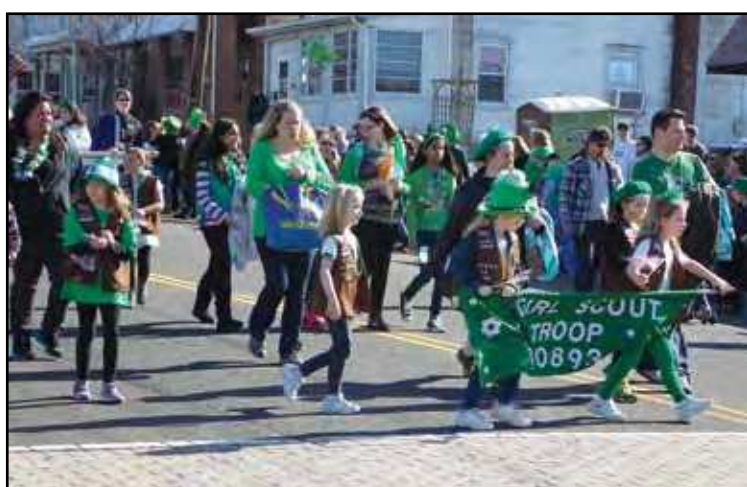
Girl Scouts march for St. Patrick's Day