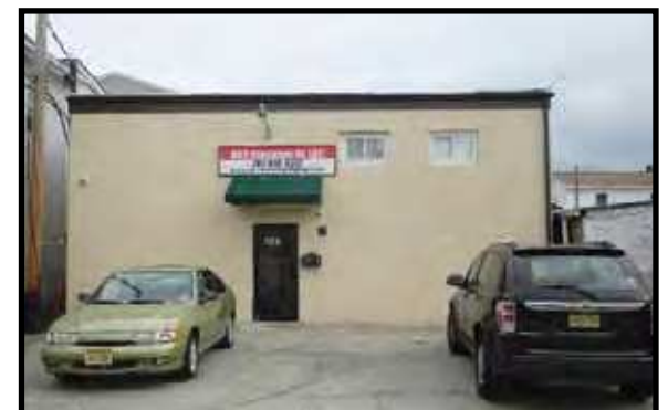
PERTH AMBOY - Bldg was renovated a year ago. $200,000