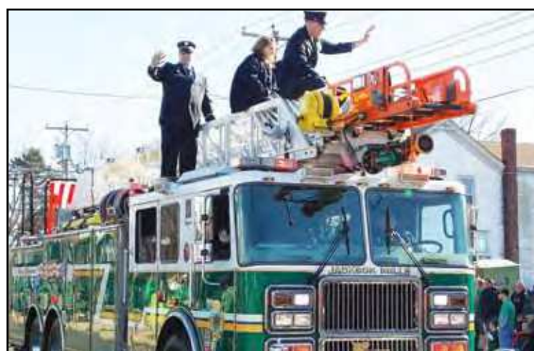
A Green Fire Truck