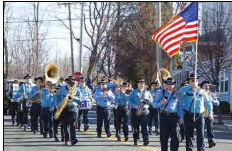
A band marches by