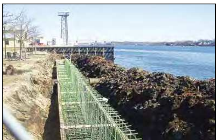
Re-securing the Retaining Wall