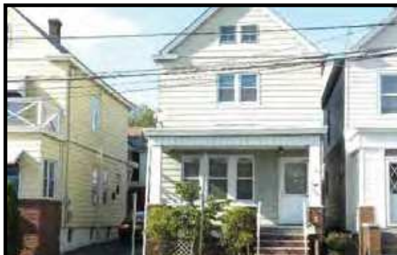
PERTH AMBOY - Back on the market. Great looking colonial, 3 bdrm close to hospital, eik and formal dining room, large living room ready for a big family. Home is being sold in "as is" condition. Buyer to obtain C/O. $169,900