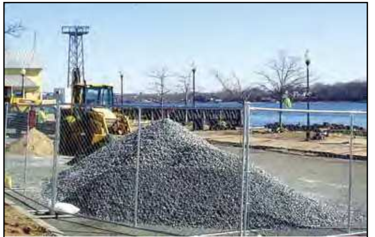
Replacing the asphalt