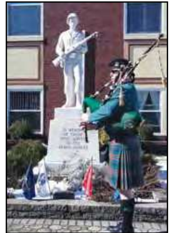
Raising of the Irish Flag and Piper at Memorial at City Hall