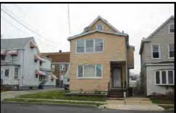
PERTH AMBOY - Hospital section, income producing property, nice...Live in one unit, let other unit help pay for your investment. $249,900