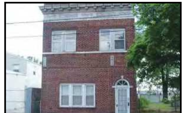
PERTH AMBOY - Great opp. to own a 4 fam. & have the tenants pay your mortgage. Very clean bldg close to most major hwy's (turnpike, pkwy, rte. 440, 287, 1 & 9). Renovated baths, kitchen, new plumbing, electric & windows. Positive cash flow!!! LOT 26 BLOCK 186 IS INCLUDED IN THE SALE. TAXES AMOUNT REFLECT THE AD-DTL. $670. $399,900