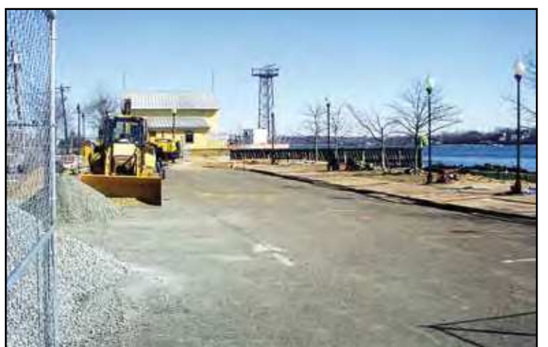
Fixing the parking lot