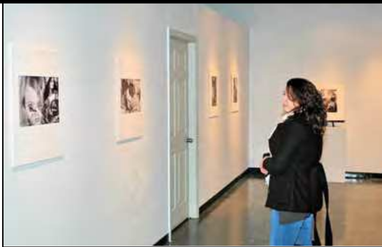
Looking at the artwork