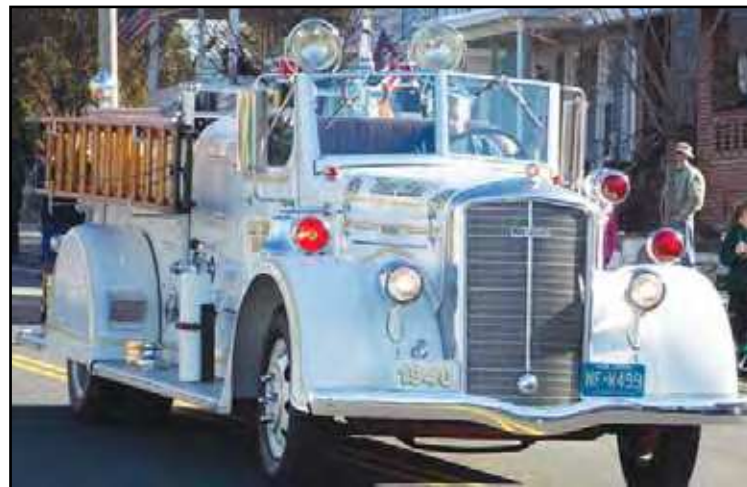
Antique Fire Truck from East Brunswick