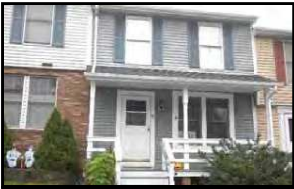
PERTH AMBOY - 2 story condo with full bsmt, newer deck and front porch, few blocks from Holy Spirit Church. Convenient to all major hwy's. $134,900