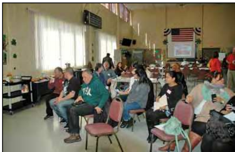
Listening to the Focus Group Speaker