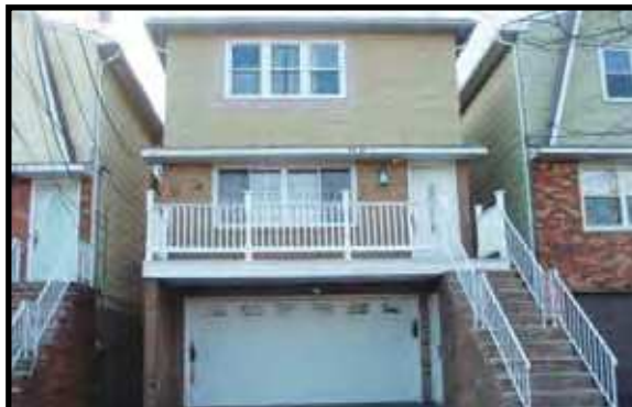
KEASBEY - Subject to third party approval. NO more showing requested by owner. $310,000