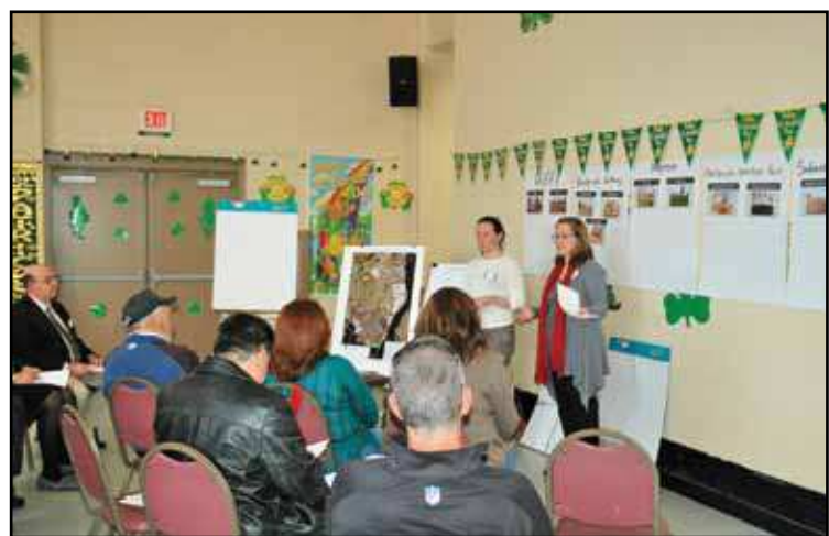
Breaking up into groups