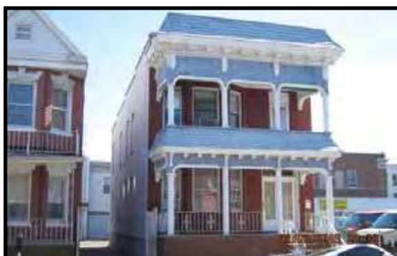
PERTH AMBOY - Wow, brick two family in the heart of Perth Amboy, well maintained, finished loft above the garages. All separated utilities. Great investment, very large two family. A "must see." $279,000