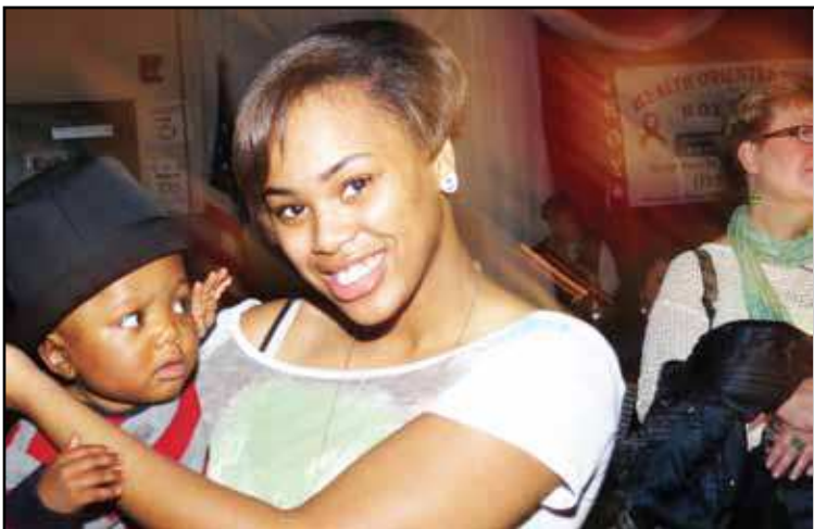
A pleasant smile for the H.O.Y. program