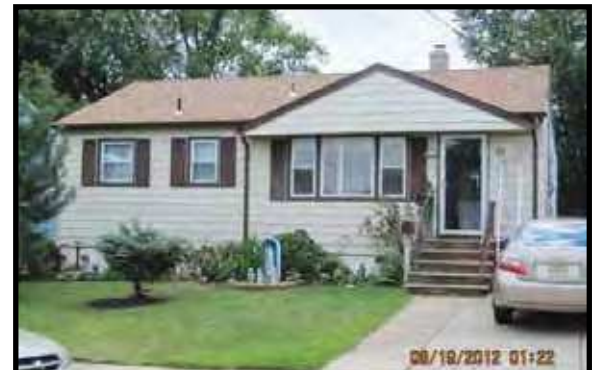
HOPELAWN - Wow! completely upgraded 3 BR Ranch w/finished bsmt, formal DR, hardwood flrs, patio, shed, central A/C, newer roof, kitchen. A "must see." $249,000