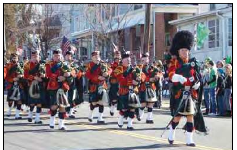
Pipe & Drum Core