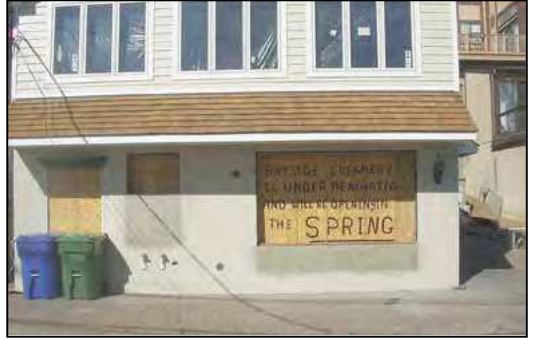
Bayside Creamery will be back in the Spring