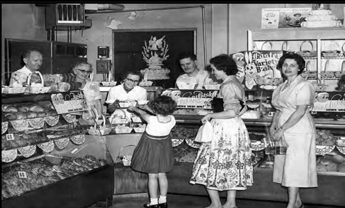
PERTH AMBOY - Easter time in the 1950's. Love those Chocolate Bunnies!