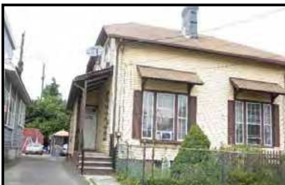
PERTH AMBOY - Everything in good condition. 4 bedroom, 1 kitchen, 1 bath. Furnace is 3 yrs. old. Short Sale. Buyer resp. for all inspections and repairs. $130,000