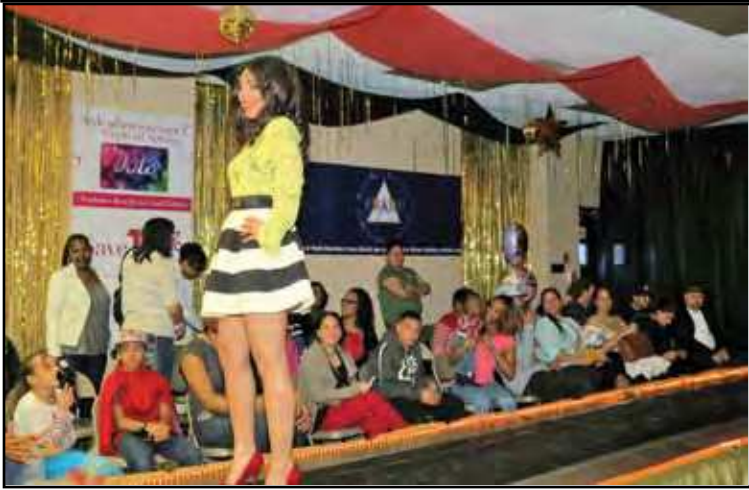
On the runway