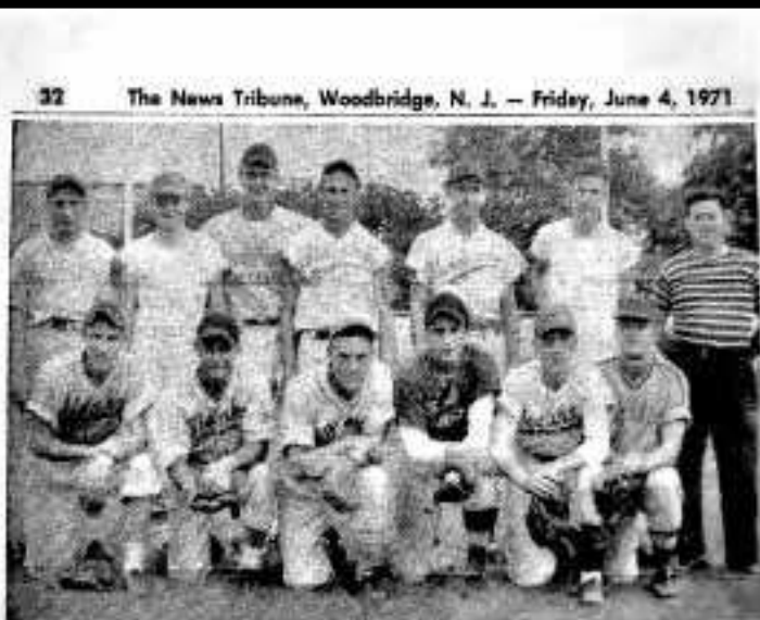
Some time ago

*Photo & article submitted by Frank Vari