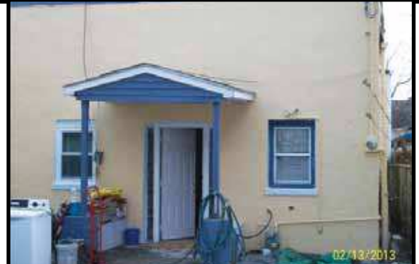
PERTH AMBOY - Why pay rent when you can own this affordable house. Property features new bath, plumbing, kitchen and floor. Nice electric fireplace, Pergo floor, storage room and plenty of parking right at front. Freshly painted. Located close to major hwy's. Come and see. You won't be disappointed. Bring reasonable offer. $9,900