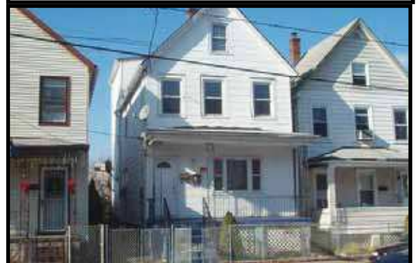
PERTH AMBOY - Great investment high school section. Buyer resp. for C/O, termite cert. and all repairs. In-ground oil tank in front of property. $169,000