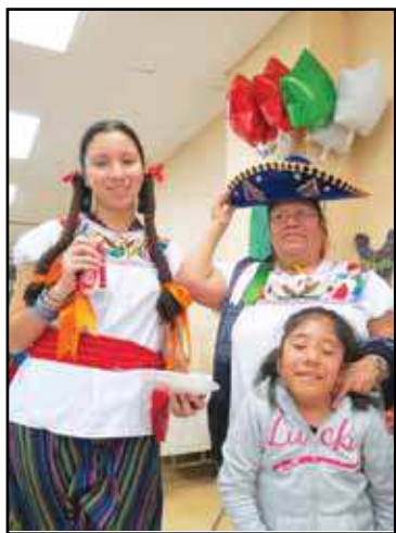
An entertainer delights a young girl