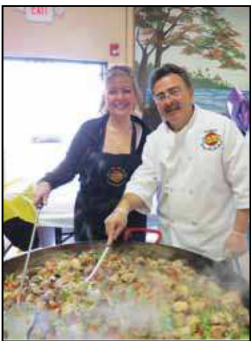
Little Spain Restaurant Catered