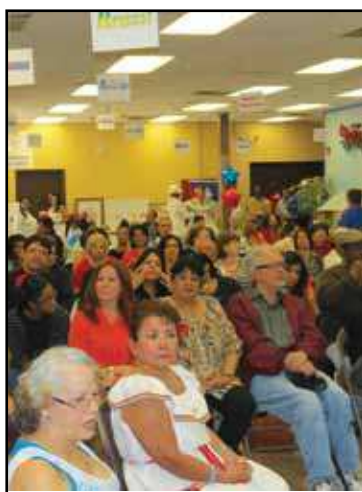
The Crowd is Mesmerized