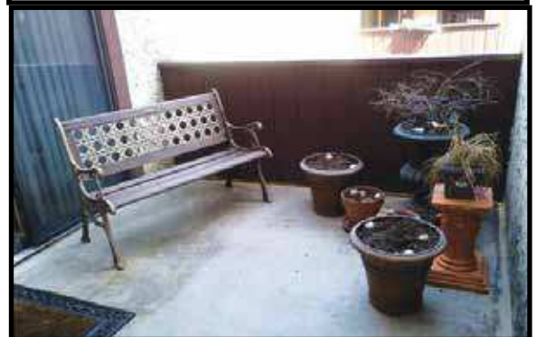
PERTH AMBOY - Waterfront section of Perth Amboy, great opportunity to be a couple of blocks from the water & have 10+ year tenant helping with the mortgage to boot. Can't beat that!!! A "must see" Very unique townhouse style multi-family. Sun drenched rooms, light & airy feeling throughout both units. Apt. 1 has huge covered patio & 2nd apt. also has patio. Call me for an appt. $249,900