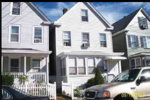
PERTH AMBOY - Well kept property by family for generations. Come and see this nice house where only one family proudly occupied. This is an estate sale. Sold "as is" No questions asked. Buyer resp. for any repairs, C/O and smoke cert. Show and bring offers. Seller willing to negotiate. Fully insulated attic. $189,900