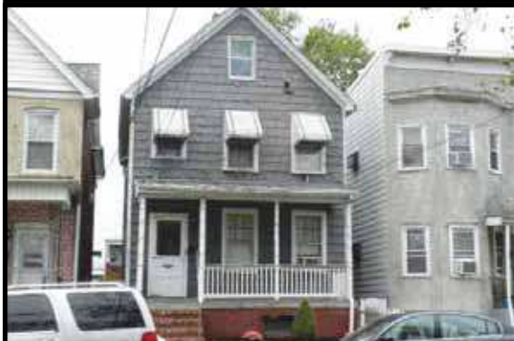
PERTH AMBOY - Nice multi-family with many upgrades. Close to public transportation, couple of blocks from train station. $399,900