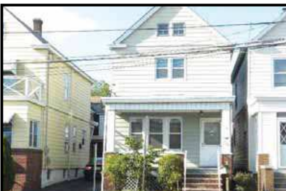
PERTH AMBOY - Back on the market. Great looking Colonial, 3 bdrm close to hospital, eik and formal dining room, large living room. Ready for a big family. House is being sold in "as is" condition. Buyer to obtain C/O. $169,900