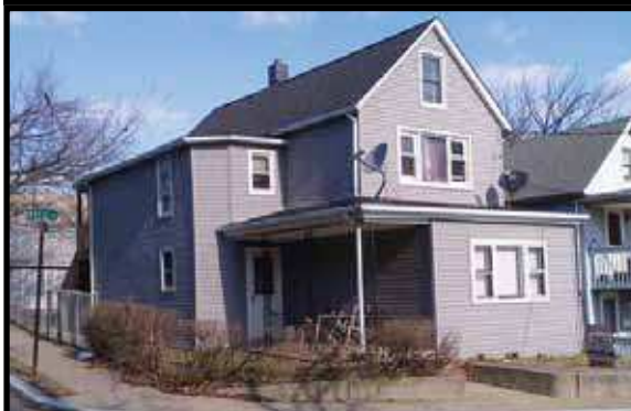
PERTH AMBOY - Surprise, nice investment or 1st home with incoming producing unit. Everything down to the water is separated. Very well maintained property with long term tenants. A must see!!! $269,900