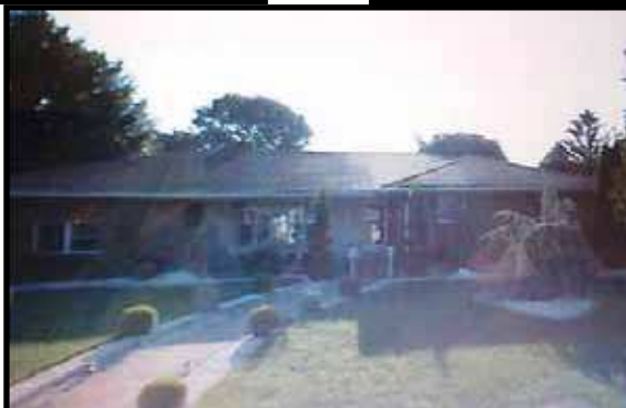
SAYREVILLE - Home offers over 1800 sq. ft. of liv. space, fully fenced (vinyl), all brand new main level with HW/ceramic flrs, 2 brand new bthrm & kitchen (granite counters & stainless steel appliances). New high efficiency furnace & HWH. Bsmt has plumbing for wet bar, full kitchen, full bath (Jacuzzi, toilet, sink & shwr.) Call me for appt. $399,900