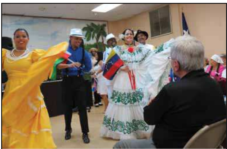
The crowd enjoyed the dancing and music