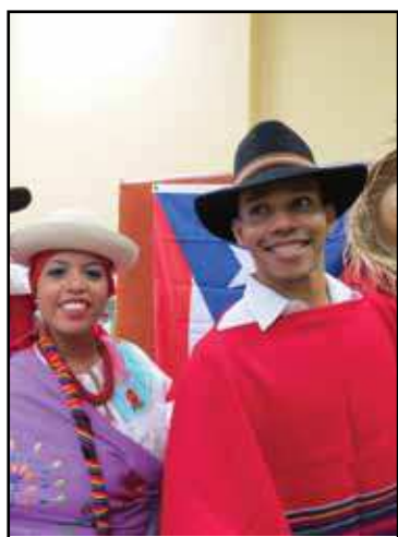
Colorful Costumed Dancers