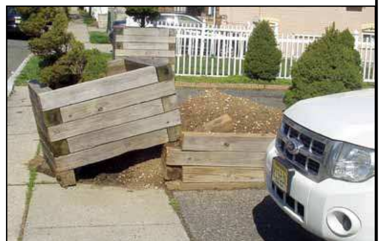
298 Bruck Ave.