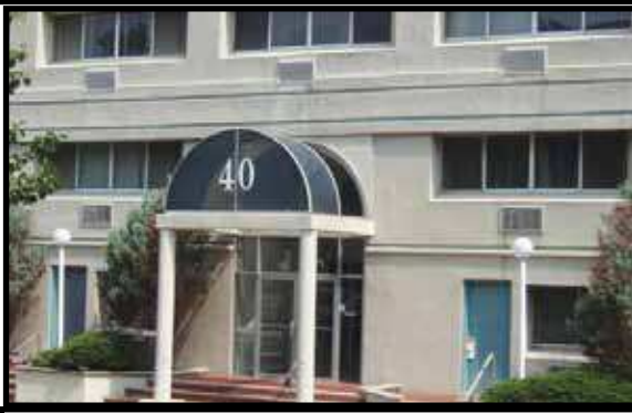
PERTH AMBOY - This is a SHORT SALE TRANSACTION. Top floor penthouse. Subject to bank approval. Please note that this is a short sale bank approved price. $114,900