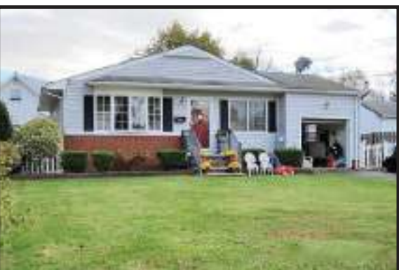
SOUTH PLAINFIELD - This is a family haven. You will adore this dramatic beautiful ranch. 3 bedroom, 2 bath, hardwood flrs, full finished bsmt, sun room, "move-in" condition and much more - a "must see." $295,000