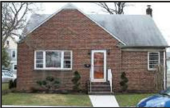
CARTERET - This charming Capecod house is ready to move in. Big corner lot. Closed to NJ Turnpike, very clean all around. Full basement. Show and bring offer. Located just one block on NJ Transit bus pickup. NYC and points south and west. HUGE PRICE REDUCTION - SELLER MOTIVATED. Bring offer. $259,900