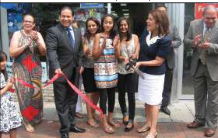
Cutting the Ribbon