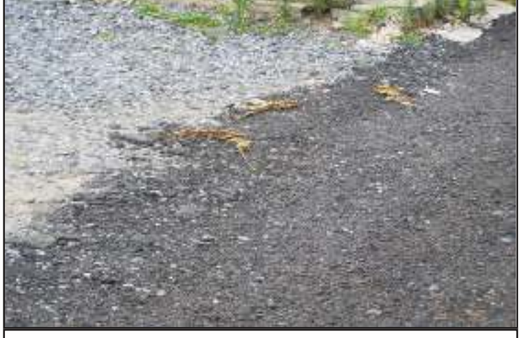
Gravel which causes spillover of water during rain