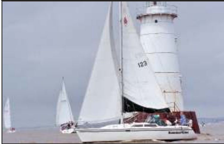
Passing the Great Beds Lighthouse