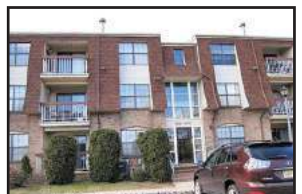
PERTH AMBOY - Priced to sell, beautiful unit located in the heart of Perth Amboy. Close to everything. Shopping, public transportation, schools, restaurants great potential. $104,000