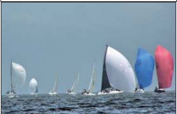
Some of the boats resembled whales emerging from the water