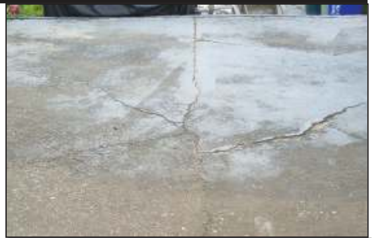
Crack in cement on the mutual driveway