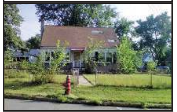
PERTH AMBOY - Short Sale. Price and Commission subject to bank approval or 203-K. $50,000