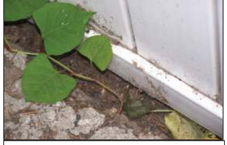
Erosion of soil