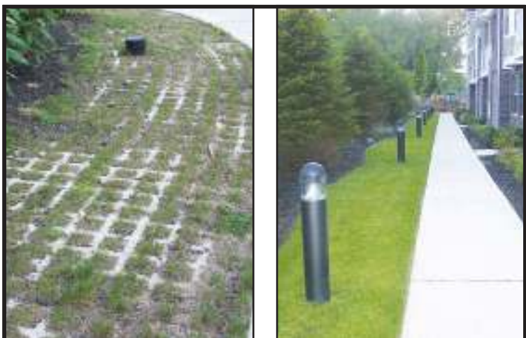
PERTH AMBOY & AVENEL - Note the contrast between the upkeep of landscape by the same developer. Left is Harbortown, Perth Amboy and the photo on the right is Evergreen East in Woodbridge Township. A Perth Amboy resident is concerned with these discrepancies and why the Perth Amboy Complex is not being maintained as well as its counterparts in other towns.