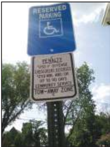
Handicapped Sign on Market Street Outside of City Hall Side Entrance