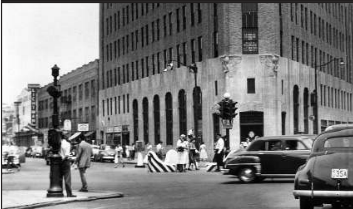
PERTH AMBOY - Smith Street circa 1940's at the 5 Corners