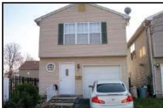
PERTH AMBOY - Very nice "Move in" condition property. This is a short sale transaction and commission will be half of bank approval if there is any change on it. $199,000