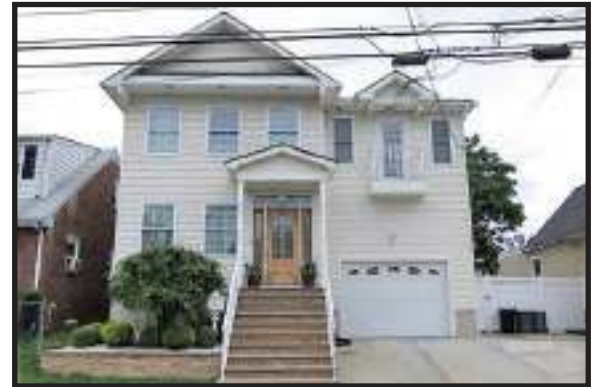
PERTH AMBOY - Stunning single family a block away from high school. This is a masterpiece completely remodeled from top to bottom. 2 full baths, 3 bedrooms, gourmet kitchen w/granite, 2 zoned A/C units, deck, garage and much more. A "must see" - truly better than new. $324,900