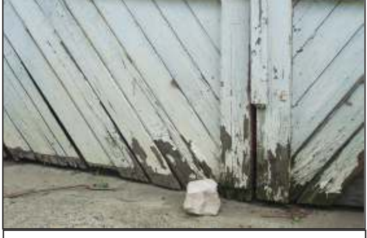
Fence shows deterioration because of excess water