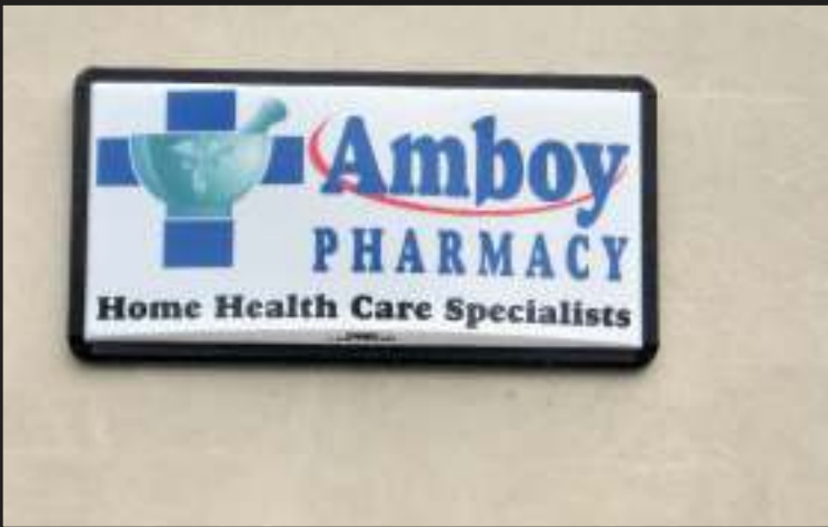
Welcome Amboy Pharmacy