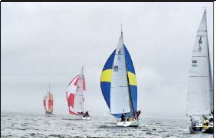
Colorful Sails dot the water