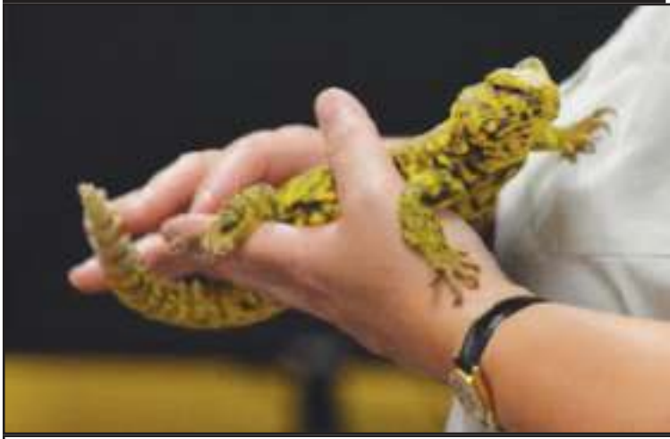
SOUTH AMBOY - To celebrate the summer "Dig into Reading" theme, the "Lizard Guys" made their appearance last week amid a crowd of 105 attendees at the Dowdell Library of South Amboy. Snakes, lizards and turtles were viewed and enjoyed by all!