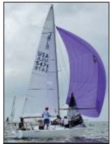
The crew of the Velocidad sets sail