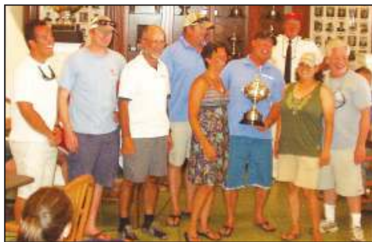
Project Mayhem wins the Adolph "Red" Grant Trophy