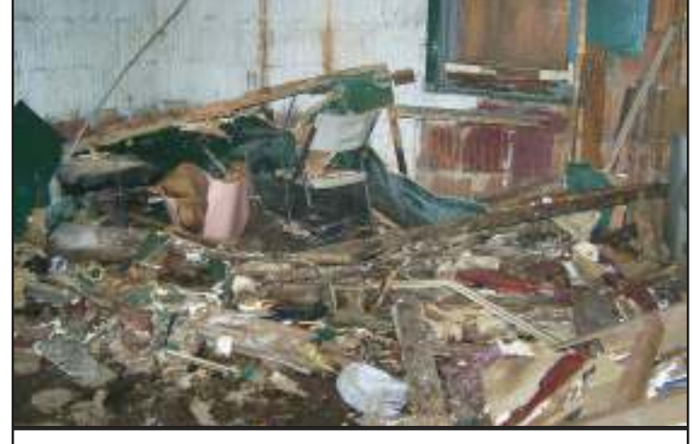
Garage shows effects of excess water after roadbed re-grading