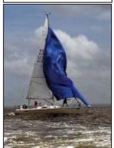
Battling rough seas nearing the end of the race