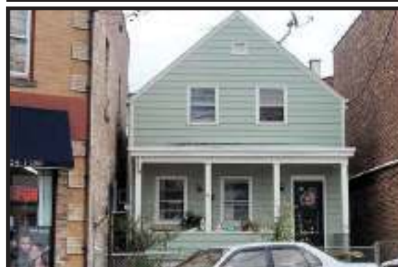
PERTH AMBOY - !!!!!SHORT SALE!!!! "Move in" condition. Buyer resp. for any repairs, C/O and Smoke Cert. $115,000