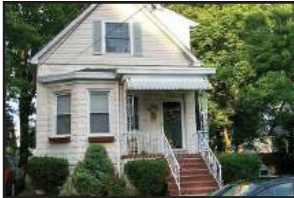
FORDS - House in perfect condition to move in. Neat and clean home with a huge backyard. Realtors show and present offer. Come and enjoy the stars at night while you sit on rear deck. $214,900