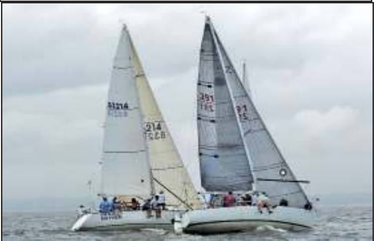
A competitor challenges the Project Mayhem