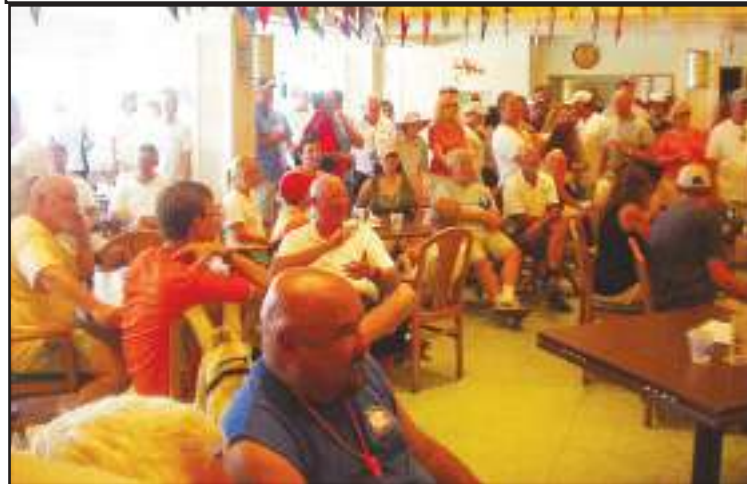
RYC Members look on as awards are presented

PERTH AMBOY - In spite of the destruction caused by Superstorm Sandy, the Raritan Yacht Club was able to recover in time to hold the 67 th Red Grant Regatta. This year was a fundraiser to restore the Perth Amboy Waterfront after Superstorm Sandy. The Club sponsored a charity fundraiser during the Regatta. For more activities go to www.ryc.org .