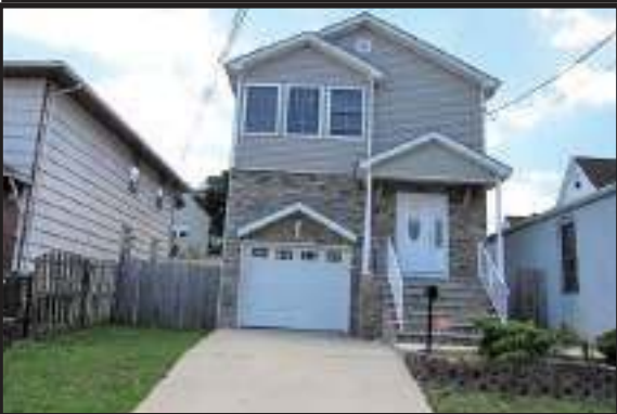
PERTH AMBOY - Beautiful 2008 colonial, high school section many extras 4 bedrooms + 2 full bath, hardwood flooring, all this and more for a great price. $309,000