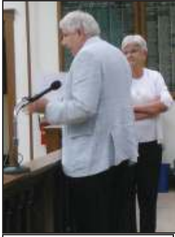
The Otlowski Family