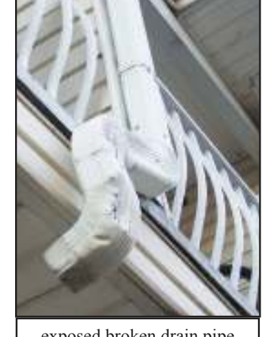
exposed broken drain pipe