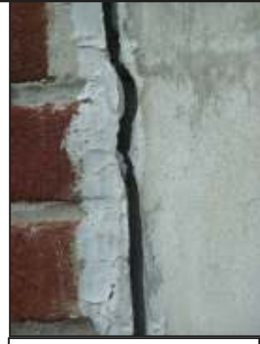
Crack in Foundation