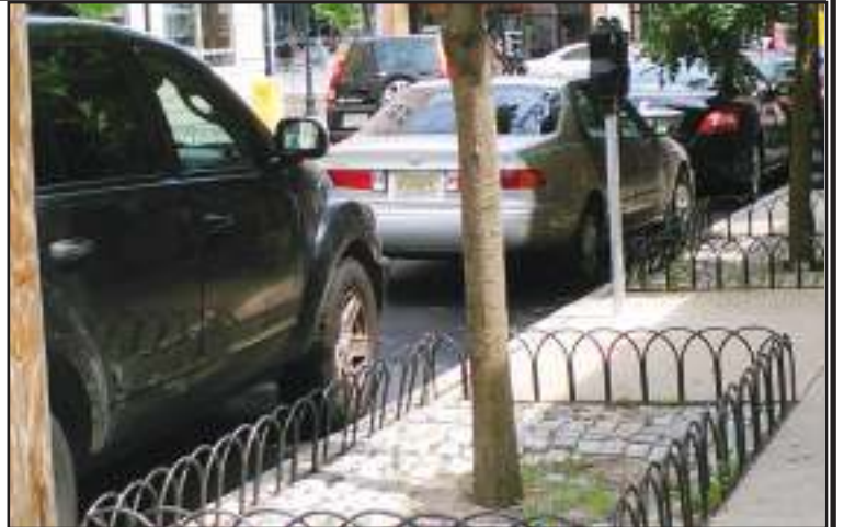
Difficulty exiting a vehicle on street side