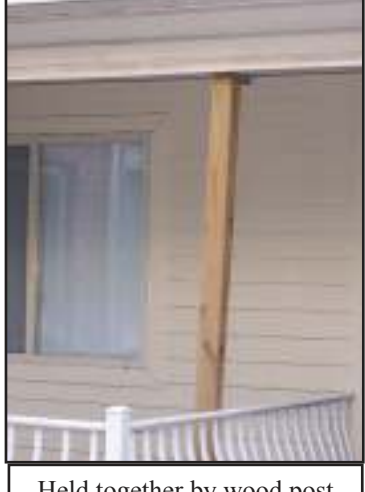
Held together by wood post