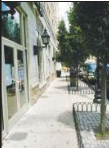
Fencing too close to store fronts