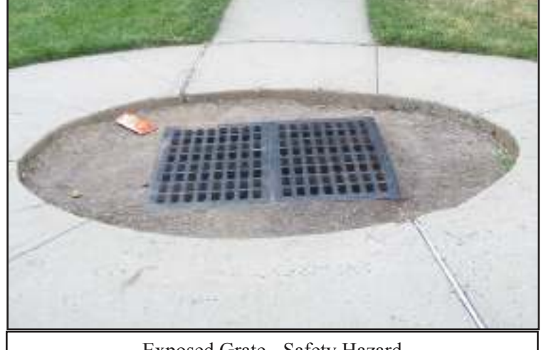
Exposed Grate - Safety Hazard