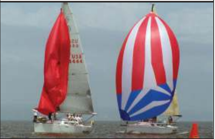
Red, White & Blue Celebrated America