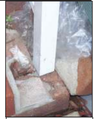
Unsafe railing exposed