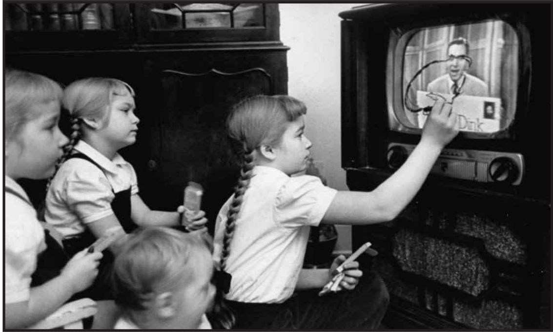
PERTH AMBOY – Kids watching television that you could write on the screen circa 1960's. This Photo was restored under a grant for the Kearny Cottage Archiving project by the Middlesex Cultural and Heritage Commission