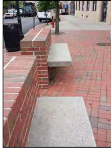
Five Corners Cement Benches