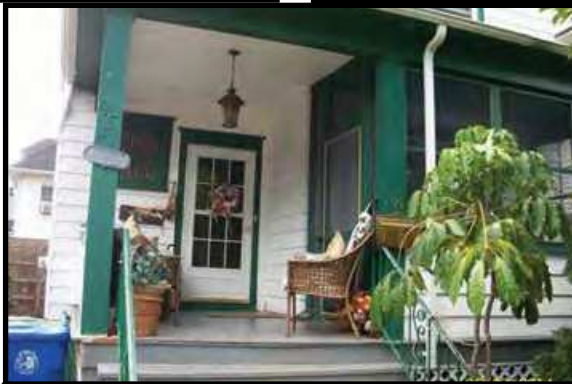
PERTH AMBOY - MOVE IN CONDITION JUST ONE BLOCK AWAY FROM WATERFRONT. PROPERTY IS IN GOOD CONDITION BUT BUYER RESPONSIBLE FOR C. OF O SMOKE CERT. AND ANY REPAIRS. SOLD STRICTLY "AS IS" NOT QUESTION ASKED. SCREENED FRONT PORCH. SHOW IT AND BRING OFFER. DINNING ROOM CHANDELIER TO BE REPLACED BEFORE CLOSING. $259,900