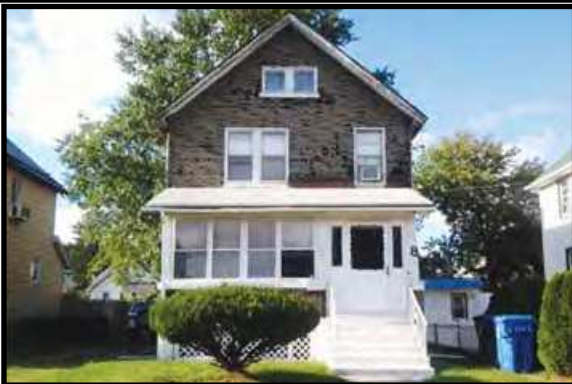
WOODBIDGE - Good location, close to train station, shopping center, downtown and schools. $180,000