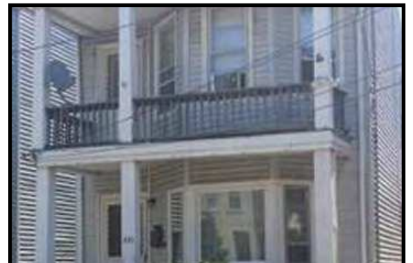
PERTH AMBOY - Attention - First Time Home Buyers and Investors. Don't miss this opportunity to purchase this beautiful two family home that's well maintained. Great investment! Not a Short Sale. $240,000