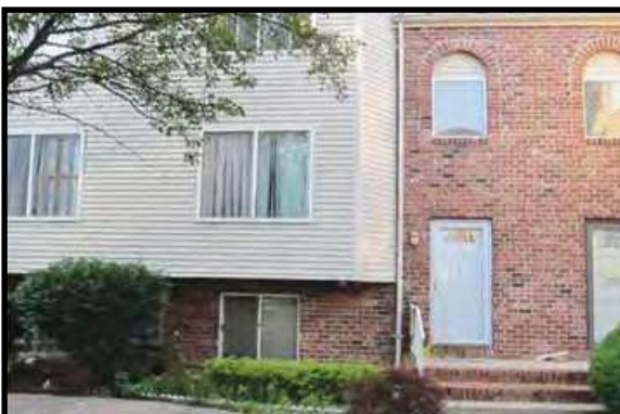
PERTH AMBOY - This is beautiful 3 bedrooms 2.5 bath, great location, central A/C. close to all major public transportation. This is a commuters dream. $165,000