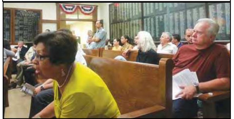
Some of the Attendees at the 7/9/14 City Council Meeting