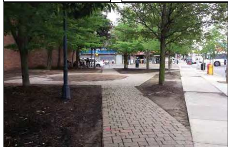
Fink Park Completely Void of Benches