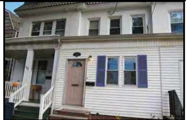
PERTH AMBOY - Large single family in the prestige water front section of Perth Amboy, lots of potential needs some TLC, priced for a quick sale. is being sold strictly is AS IS condition. buyer is responsible for C/O, termite cert. and all repairs. Tenant pays $1465.00 lease ends 4-30-14. $99,000