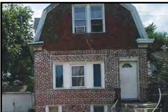
PERTH AMBOY - NICE HOUSE MOVE IN CONDITION, 6 EXTRA PARKING SPACES. BUYER RESPONSIBLE FOR C/O & ALL REPAIRS. $139,000