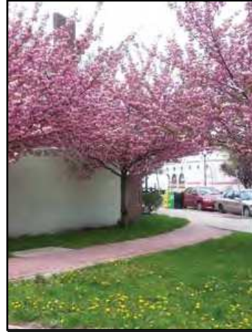
Park Near Jefferson Street Parking Deck