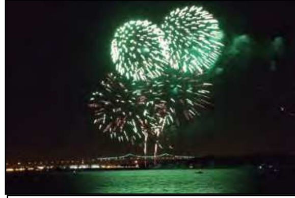
Fireworks over South Amboy