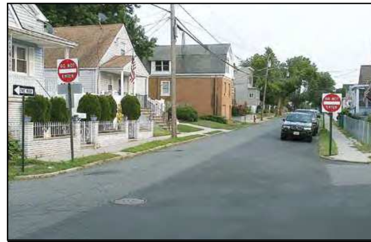
PERTH AMBOY - Mary Street - Residents said that they received short notice that their street would be changed to one-way