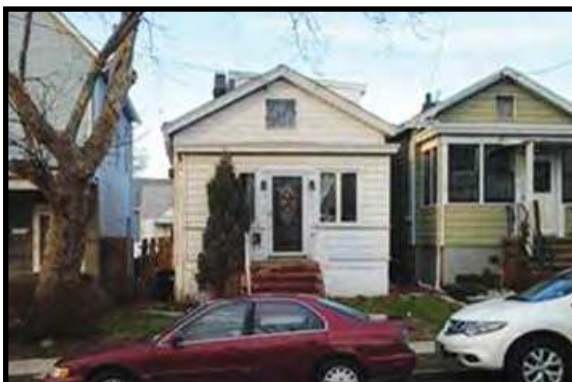
PERTH AMBOY - NICE STARTER HOME, QUIET AREA NEAR WASH PARK. THIS IS A SHORT SALE AND IS BEING SOLD IN "AS IS CONDITION" BUYER RESP. FOR C/O AND ALL REPAIRS. $99,000