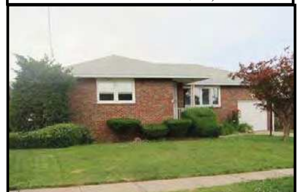
PERTH AMBOY - This is a beautiful brick ranch with lots of potential with 3 bedrooms, large living room, formal dining room, Florida room, best location in town a nice family neighborhood, if you want privacy this is it. All hardwood floors needs come TLC. THIS RANCH IS A MUST SEE!!!! $285,000