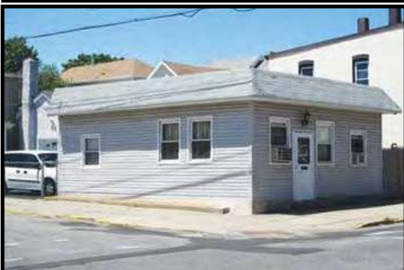
PERTH AMBOY - Move-in condition 3 BR, all renovated, close to all major highways, schools and public transportation. buyer is resp. for all repairs and C/O. $159,000