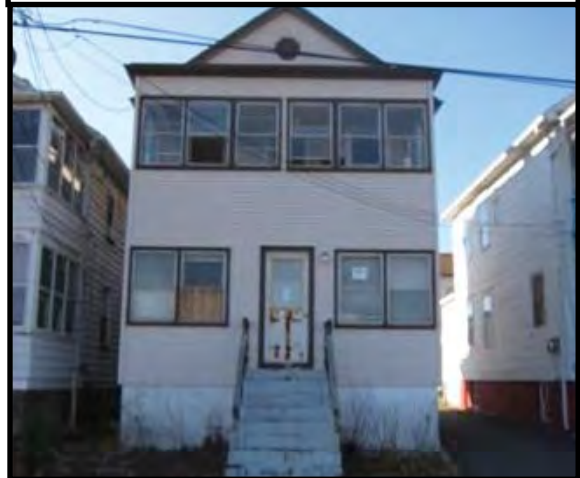
SOUTH RIVER - Great Potential. Handyman Special. Is Being Sold "as is." Buyer resp. for smoke cert., termite cert., and all repairs. $168,000