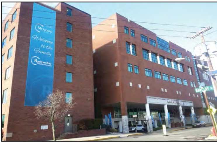
Front view of Raritan Bay Medical Center which has now merged with Meridian Health.

The merger follows state approval and due diligence review. Through the merger, Meridian and Raritan Bay will utilize their combined talent and resources to enhance access to care and improve clinical quality and service to the community, decrease costs through shared efficiencies and purchasing opportunities, and provide new academic and research opportunities for physicians, nurses, and clinicians.