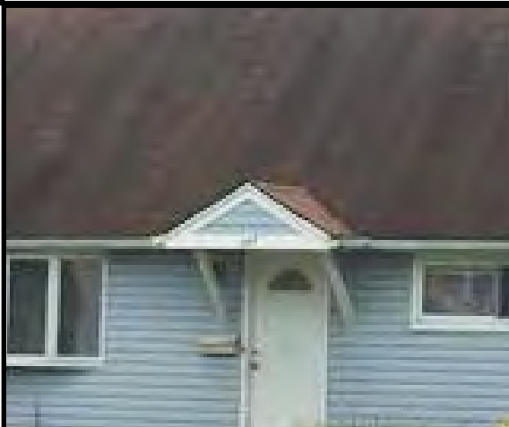
EDISON - Beautiful cape cod. Lots of potential. Is being sold strictly "as is". Buyer responsible for smoke cert, termite cert., and all repairs. $280,000