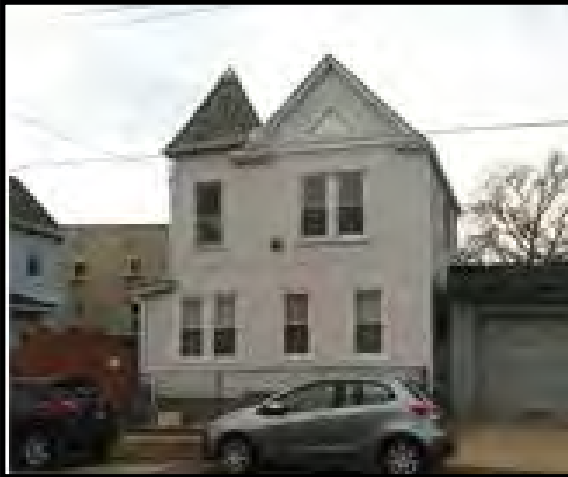
PERTH AMBOY - Nicely updated colonial in the heart of Perth Amboy. Ready for a new family. 3 bedrooms, 1.5 baths, new kitchen(granite/stainless steel appl), new washer/dryer in bsmt. Great covered patio for grilling. A must see. $154,900