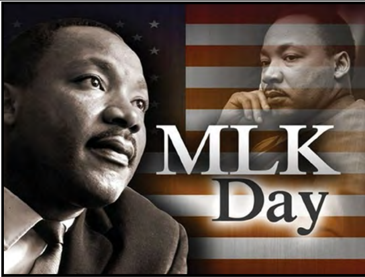
Martin Luther King, Jr January 15, 1929 - April 4, 1968

Martin Luther King, Jr. Day became a national holiday in 1986 and is celebrated on the third Monday in the month of January. Although Dr. King was closely associated with nonviolent protests for African Americans he also fought for equality for all to make decent living wages.