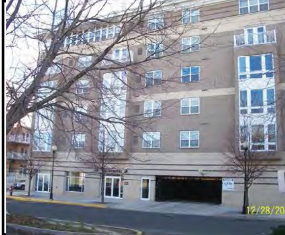
PERTH AMBOY - ESPECTACULAR WATER VIEW ON THIS TWO LEVEL APARTMENT. JUST MOVE IN AND ENJOY THE VIEW FROM THE WIDE OPEN WINDOW. COMMISSION TO BE SPLIT 50/50 TENANT/LANDLORD. $1,825/Mo Rent