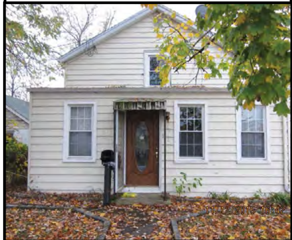
PERTH AMBOY - LOVELY HANDYMAN SPECIAL. Minutes away from the beach and boardwalk. "As Is". Buyer resp. for smoke, termite, and C/O certifications. $83,900