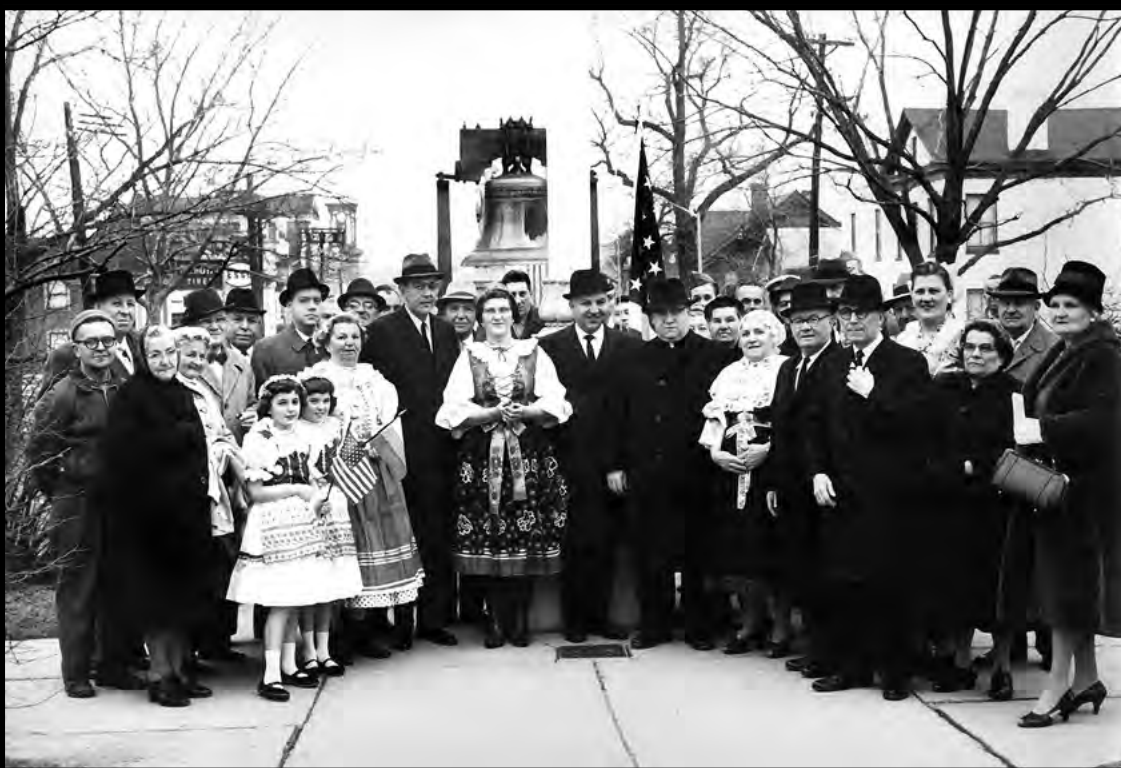
PERTH AMBOY - Slovak Flag Raising - October 1960's - City Hall Circle.