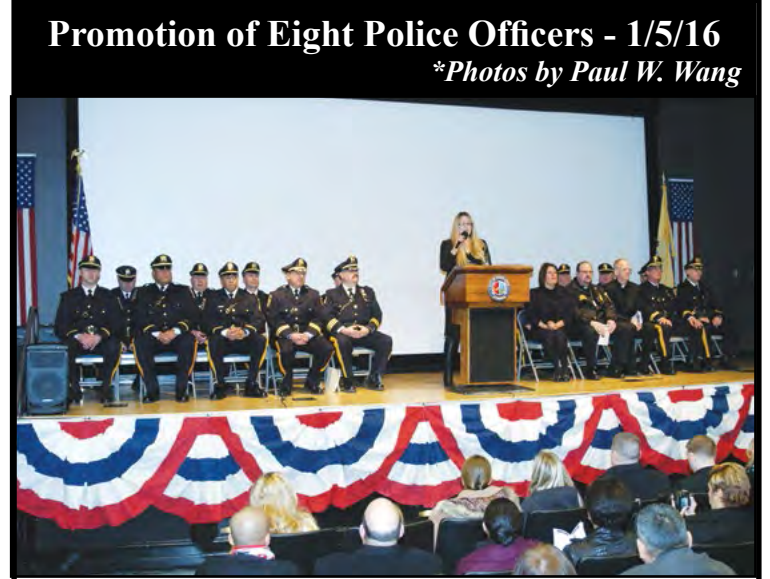
Promotion of Eight Police Officers - 1/5/16

SAYREVILLE - The monthly meeting of the Ladies Auxiliary of #4699 will be on January 26, 2016 at 7 p.m. at Jernee Mills Road. Many items to discuss for the new year. All members are invited to attend. A light lunch will be served. For more info call 732-264-3041.