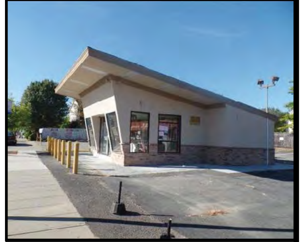
PERTH AMBOY - Ideal location with lots of exposure, ample parking space. Many possibilities. Location, Location triple NNN $2,600/Mo Rent