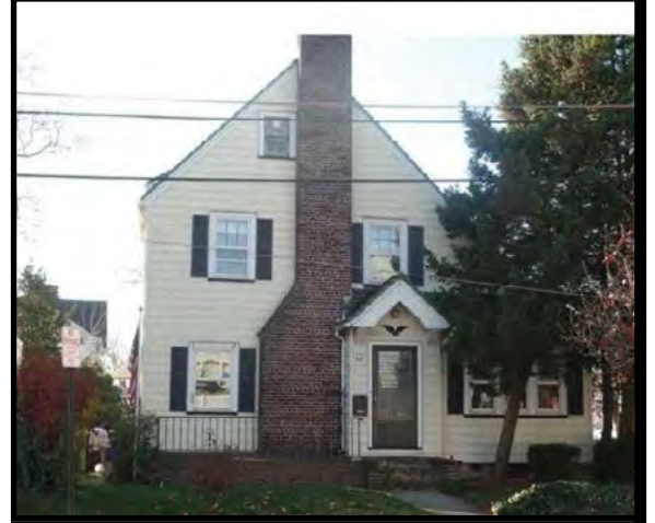
PERTH AMBOY - Wow, absolutely beautiful single family in the water front section of Perth Amboy, in fact you can watch the ships pull into the Raritan Bay from this stunning 4 bedroom, fire place, sun room, custom built, quality shows in its design. This is a once in a lifetime opportunity. will not last!!!!!!!!!!!!!! $259,000