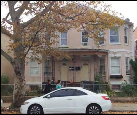
PERTH AMBOY - 3 Bedroom Apartment. $1,500/Mo Rent

THE VALUE OF YOUR HOUSE HAS INCREASED. DO YOU WANT TO FIND OUT HOW MUCH? PLEASE CALL FOR FREE MARKET ANALYSIS!