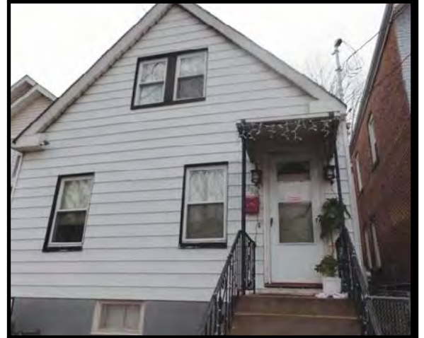
PERTH AMBOY - Just blocks from High School, Grocery Stores, Public Transportation and Hospital. Move-in condition cape Cod-style beautiful oak kitchen cabinets 3 bedroom, 2 full baths, finished bsmt and much more. $169,000