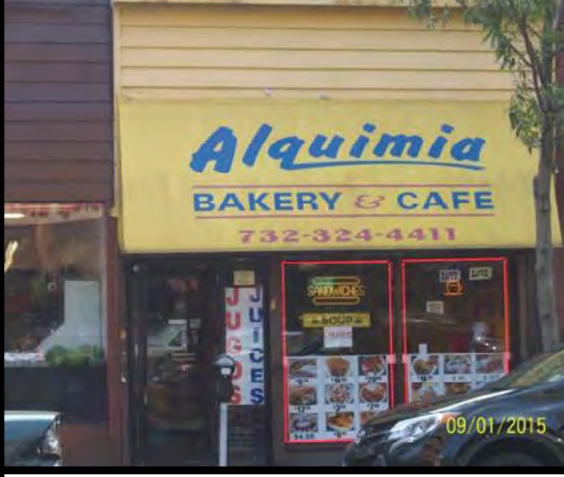
PERTH AMBOY - THIS IS THE OPPORTUNITY TO BECOME YOUR OWN BOSS. GREAT POTENCIAL INCOME LOCATED IN DOWNTOWN BUSINESS AREA. ALL EQUIPMENT INCLUDES ON SALE. CENTRAL AIR, USE OF BASEMENT AND LOT MORE. LEASE END ON FEBRUARY 2016. RENEWABLE EVERY 3 YEARS WITH 5% INCREASE. $120,000