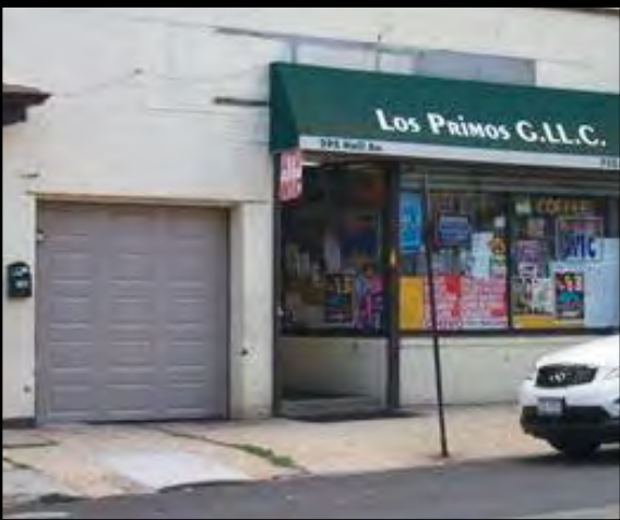
PERTH AMBOY - PROPERTY WITH LOT OF POTENCIAL AND GOOD INCOME SOURCE. PROPERTY STRICTLY SOLD "AS IS" CONDITION. OWNER WON'T MAKE ANY REPAIRS AND BUYERS RESP. FOR ALL CERTIFICATES REQUIRED BY CITY AND/OR STATE. NOT QUESTION ASKED. $375,000