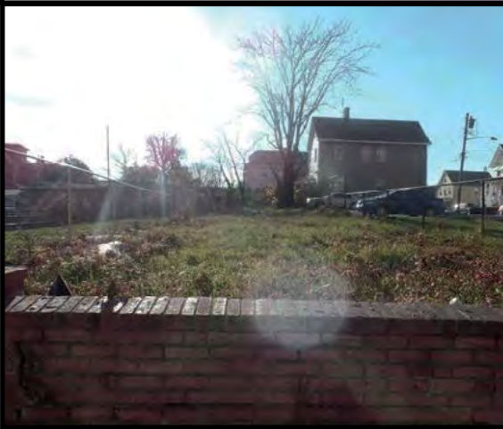
PERTH AMBOY - Buyer is resp. for variance and permits. $55,000