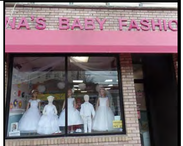
PERTH AMBOY - VERY STABLE BUSINESS!! Up and Coming for more than 3 years! This is a perfect opportunity to be your own boss and start your business!! Located in the heart of Perth Amboy! It comes with more than 20K worth of inventory! $35,000