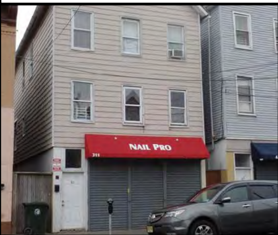
PERTH AMBOY - Great location for retail in the heart of Perth Amboy Down Town. all separated utility. $2,200/Mo Rent