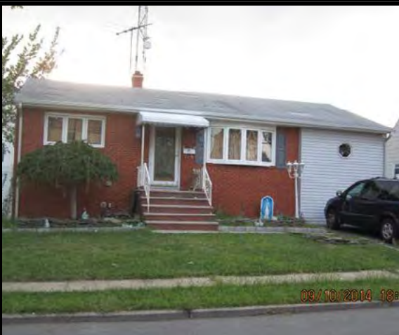
FORDS - Beautiful Ranch 2 bedroom contemporary stylish with many upgrades including kitchen cabinets . it is being sold in "AS IS" condition. Buyer is resp. for Smoker cert and all repairs. $185,000

THE VALUE OF YOUR HOUSE HAS INCREASED. DO YOU WANT TO FIND OUT HOW MUCH? PLEASE CALL FOR FREE MARKET ANALYSIS!