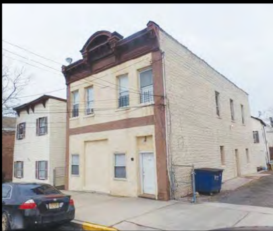
PERTH AMBOY - This is three buildings for the price of one, fully rented great income producing business. 4 Family in the front, a two family in the rear and another two family on the side all in one package. $1,100,000