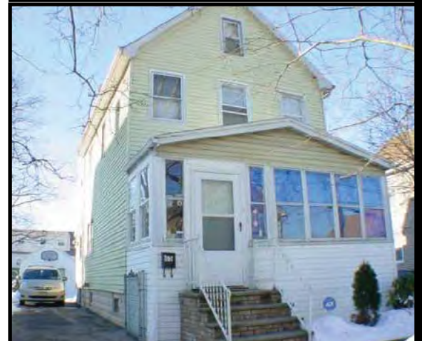
CARTERET - Short Sale. Buyer resp. for C/O inspection. Bank Approved 180,000.00. $180,000