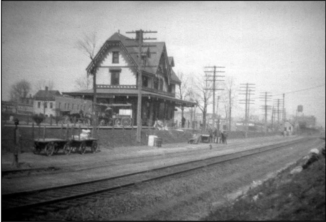
PERTH AMBOY - Train Station April 1888. This photo was restored under a grant from the Middlesex County Cultural and Heritage Commission to the Kearny Cottage Historical Association.