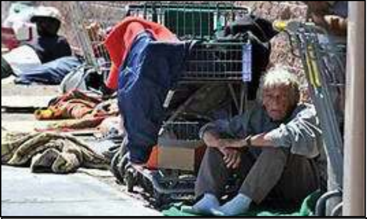
Hopelessness Across the United States