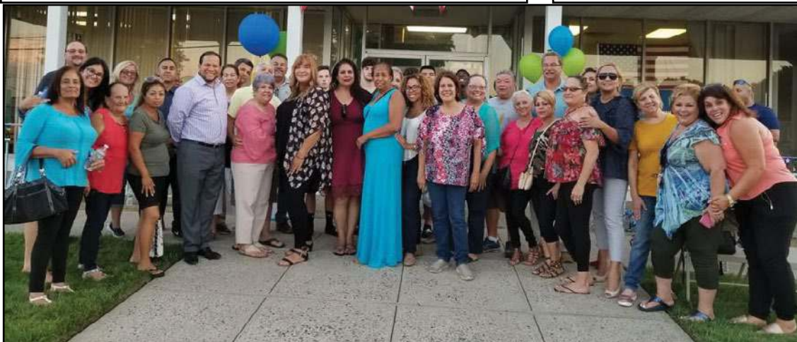
Working For You