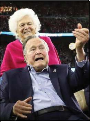
At the Feb. 5, 2017 Super Bowl 51 Coin Toss

you for an example of what love and commitment is all about. C.M.