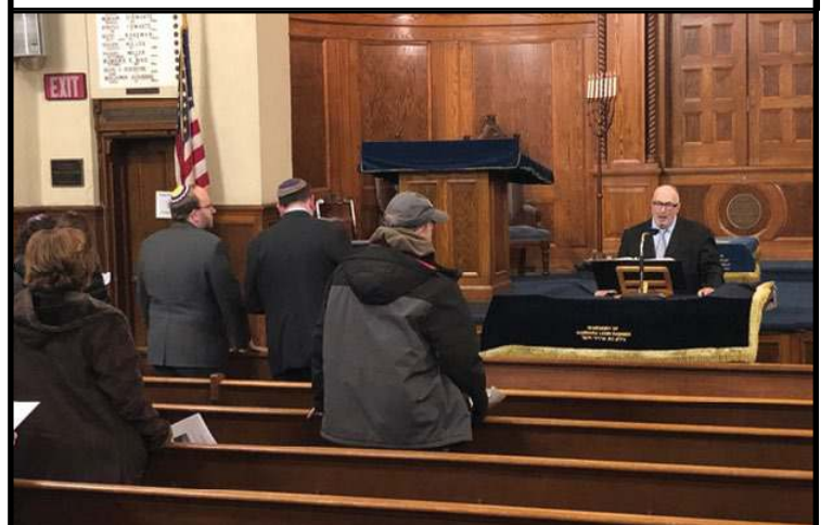
A cantor sings a prayer to the attendees