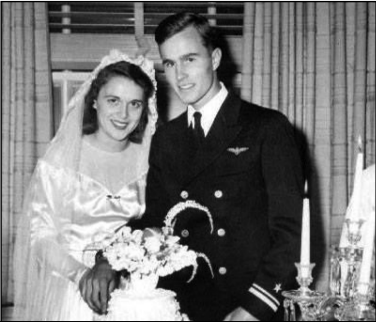
George and Barbara Bush on their Wedding Day Jan. 6, 1945