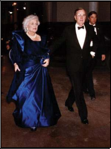
At the Inaugural Ball 1989