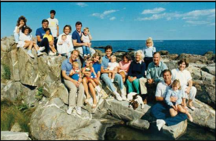
The Bush Family on the beach