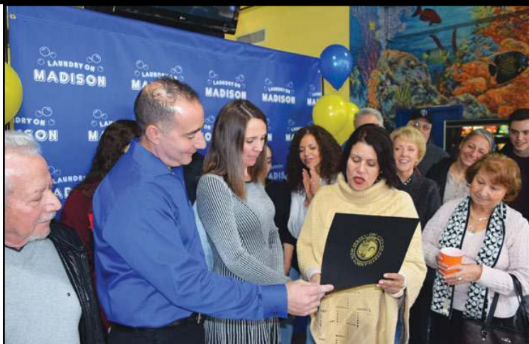
Laundry on Madison receives a proclamation from the Mayor

PERTH AMBOY - St. John's Orthodox Church will be holding their Annual Cake Sale. Cakes are $12 Each and are Walnut, Poppyseed, Prune/Le-kvar, Apricot, and Raspberry. If you would like to place an order please call (732) 826-7067 from Dec. 3 thru Dec 6, 2018 from 9:00 a.m. - 12:00 p.m. Please call early before the quota is filled. Pick will be on Dec. 12 & 13 at 404 Division Street, Perth Amboy, NJ after 2:00 p.m.