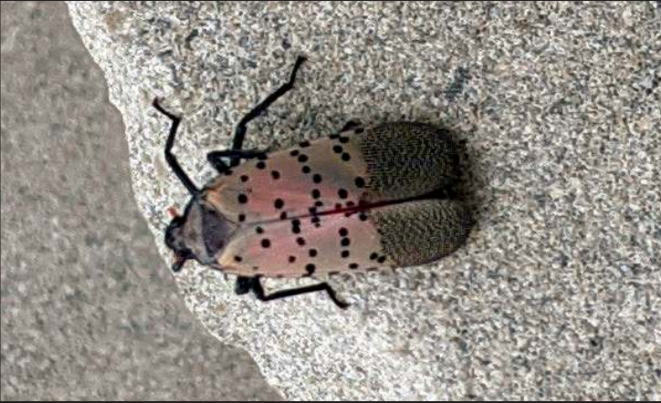
Photo of a Spotted Lantern Fly. They are considered an Invasive Species and it is recommended to kill it on sight. To report a sighting, email SLF-plantindustry@ag.nj.gov .