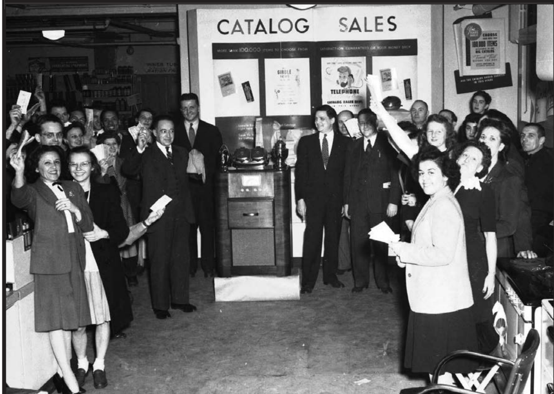
PERTH AMBOY – Catalog Sales 1940's