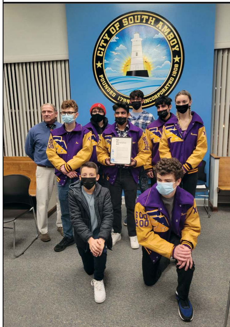
SOUTH AMBOY - The South Amboy Cross Country Team were honored at the 12/15/21 Council Meeting