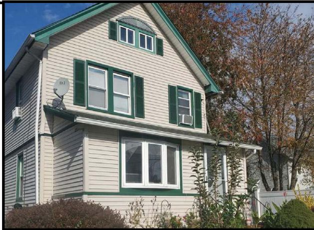
WOODBIDGE PROPER - This freshly painted Colonial offers generous space for the extended family, including 5 good-sized bedrooms, large living room, formal dining room, and a galley-style kitchen with additional recreational space in the partially-finished basement. This home has a full stand-up attic which offers plenty of additional storage space. Attention commuters, this property is very close to train station, buses, and major highways as well as close to shops and restaurants. Home is being sold as-is. Come, see, and make an offer! Showings start 11/27/21. $489,000