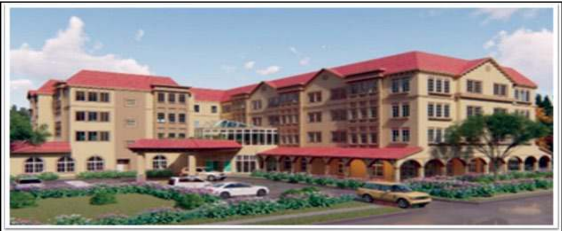
PERTH AMBOY - This architectural rendering reveals what the soon to be built Waterfront Complex, St. Demetrios Housing for Active Adults which will feature a 300-person multipurpose community center will look like once the major construction project is completed. *Photos submitted