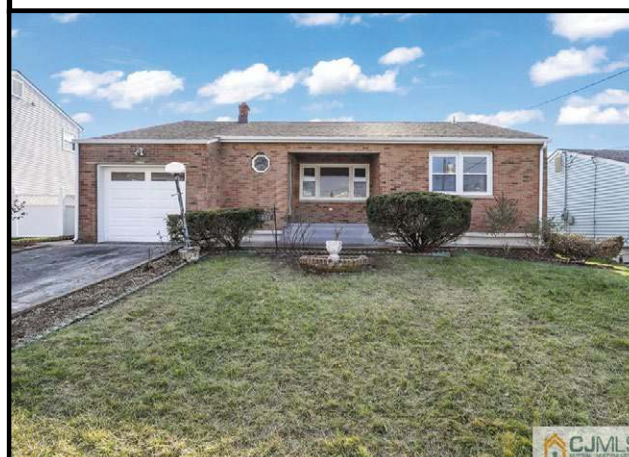
PERTH AMBOY - Welcome Home!!! Nothing To Do But Unpack And Enjoy! The Great Area Of Spa Springs, Perth Amboy. Renovate From Top To Bottom, Features Hardwood Floor Throughout, Central Ac, New Windows, New Doors, New Kitchen And 3 New Bathrooms. Full Finished Basement With Plenty Of Extra Entertaining Space, Office, 2 Storage Rooms And Full Bathroom. Public Transportation To Ny Available. $480,000