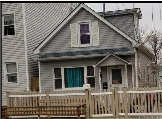
PERTH AMBOY - A great opportunity to own this cozy house. Single family home with three bedrooms. $289,000

PETRA BEST REALTY WILL GET YOUR HOUSE SOLD FAST!!! PLEASE CALL FOR FREE MARKET ANALYSIS!