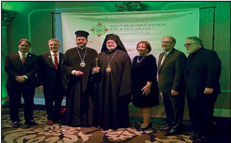
PERTH AMBOY- Christmas Benefit with His Eminence Archbishop Elpidophoros as St. Demetrios Church's honored speaker

Philotimo Housing Urban Corporation and the Greek Orthodox Metropolis of New Jersey hosted a Christmas Banquet to re-initialize the St. Demetrios Housing for Active Adults