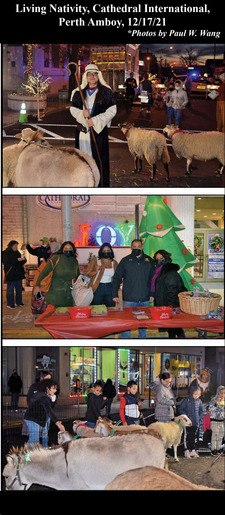
Living Nativity, Cathedral International, Perth Amboy, 12/17/21