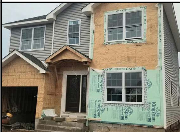
EDISON - Welcome to Edison. New!!! From Top to Bottom. On The First Floor You Have Living Room 18 X 12, Kitchen, Dining 14.8 X 12 Combination. Entertaining Is Always Easy With The Open Concept And Big Kitchen Island With Granite Countertop, Plenty Cabinets. Second Floor 3 Bedroom And Office Room 6 X 10. The Master Is 21.10 X 12.4 With A Full Bath. Finished Basement With Laundry Room, 1/2 Bath. Save Water and Gas with The Modern Water Heater Tankless. You Will Be In Love With This New Property. Don't Wait. $639,000