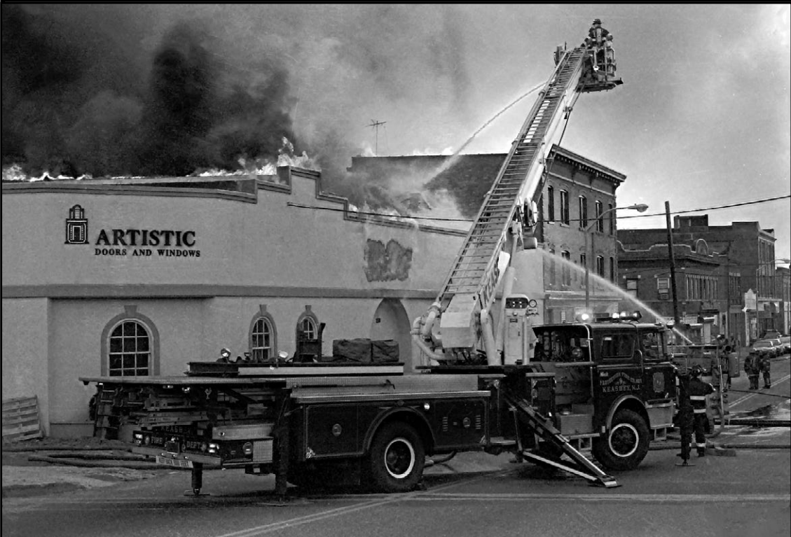
PERTH AMBOY – Keasbey Fire Department at the Artistic Doors Fire, 1980's.