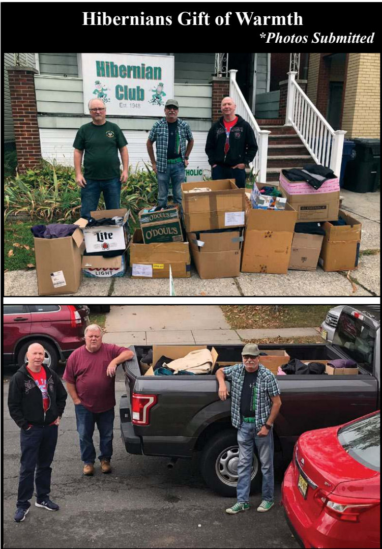
Hibernians Gift of Warmth PERTH AMBOY - The Ancient Order of Hibernians, John Barry Division 3, Perth Amboy, recently held a Gift of Warmth coat drive. The Club collected over 100 coats that were donated to the St. Vincent DePaul Society and distributed to the local community.